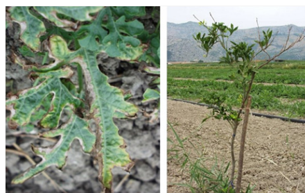
Symptoms of salinity stress in the Neretva river valley