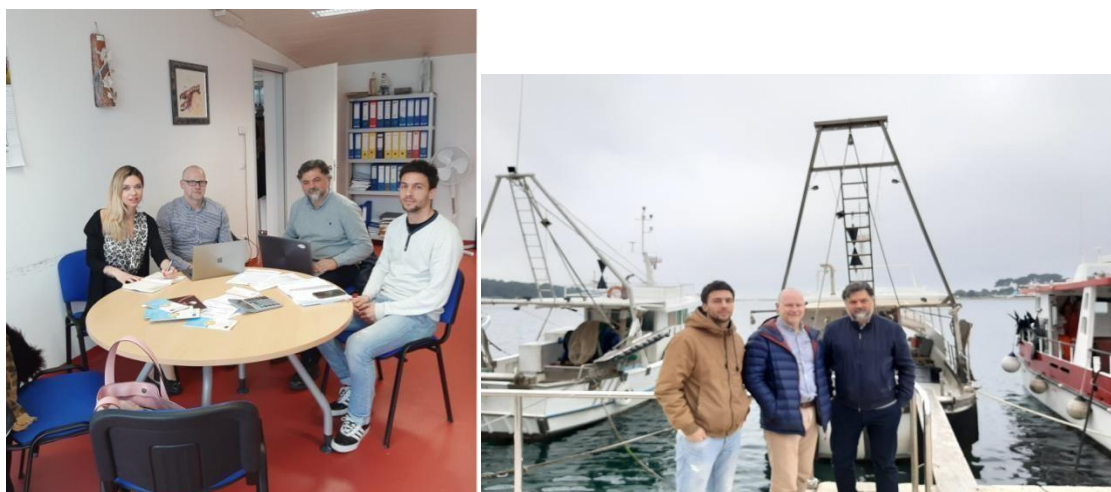
Fig. 6.1. - Meeting at ISTRA premises and visit at the Porec fishing port

In Benkovac, it was possible to visit OMEGA 3 premises and to have a look at the processing operations.