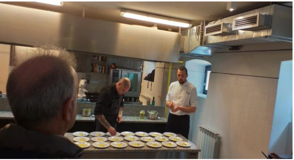
Gortanov brijeg, Pazin