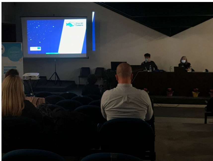
Figure 5 Final event at Sealogy (Ferrara, IT)