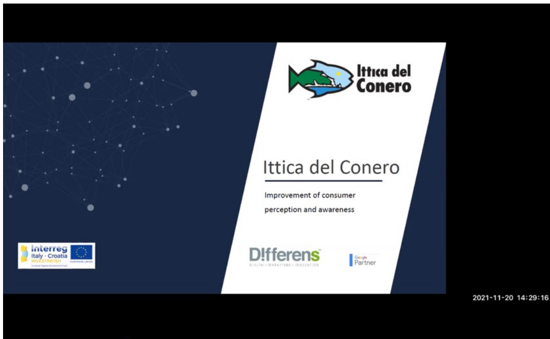
Figure 9 Webinar final event – screenshot