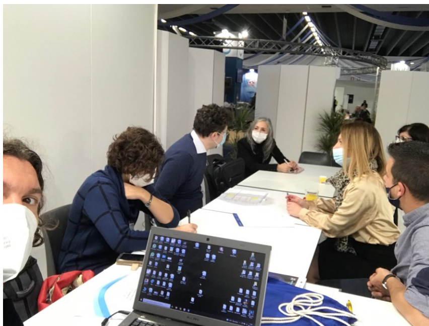
Figure 3 Final event at Sealogy (Ferrara, IT)