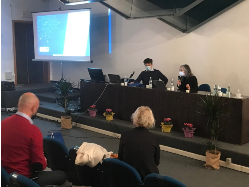
Figure 6 Final event at Sealogy (Ferrara, IT)