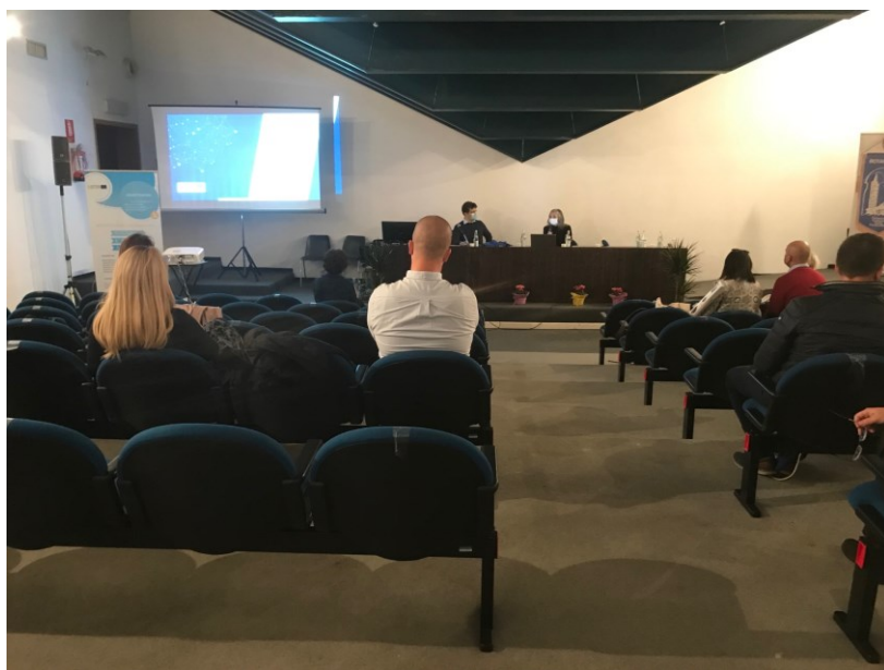
Figure 4 Final event at Sealogy (Ferrara, IT)