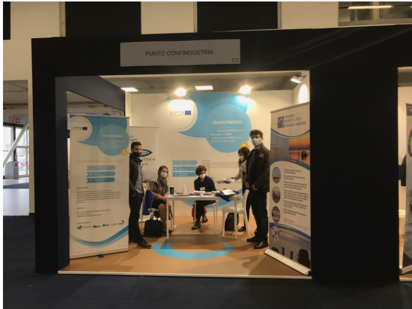
Figure 2 Final event at Sealogy (Ferrara, IT)