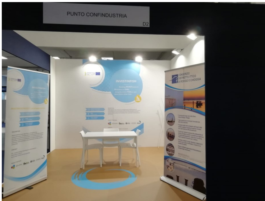
Figure 7 Final event at Sealogy (Ferrara, IT)