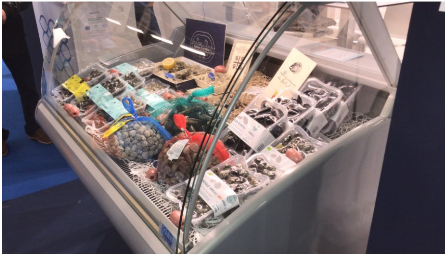
Figure 1 Final event at Sealogy (Ferrara, IT)