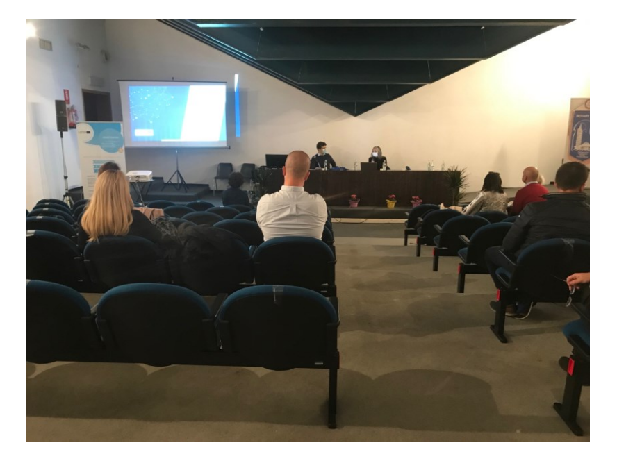
Figure 4 Final event at Sealogy (Ferrara, IT)