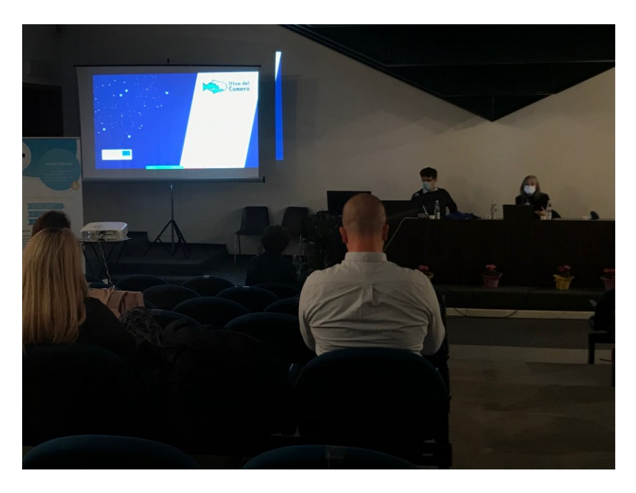
Figure 5 Final event at Sealogy (Ferrara, IT)