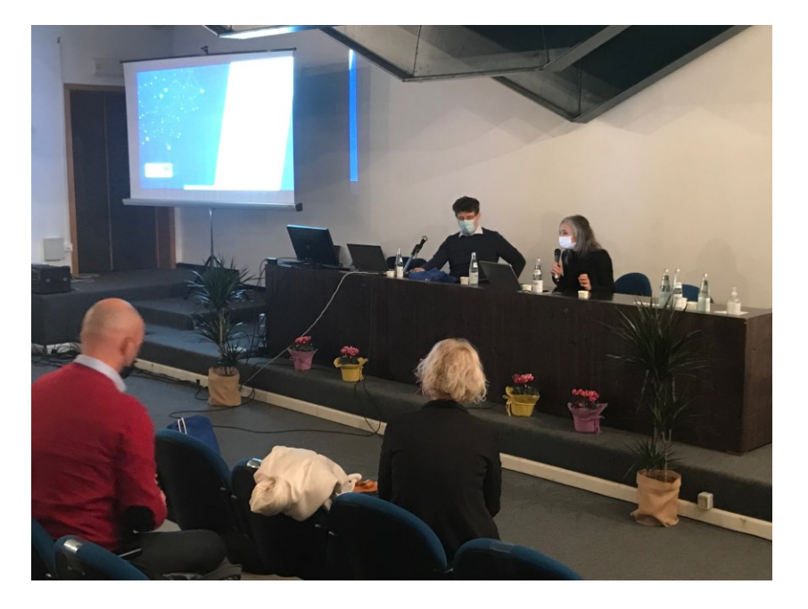
Figure 6 Final event at Sealogy (Ferrara, IT)