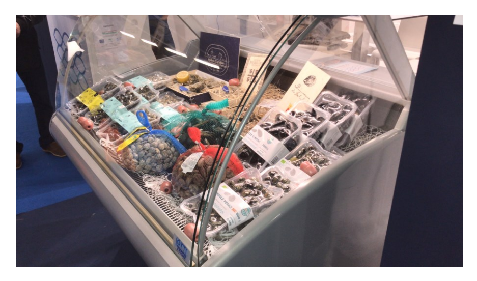
Figure 1 Final event at Sealogy (Ferrara, IT)