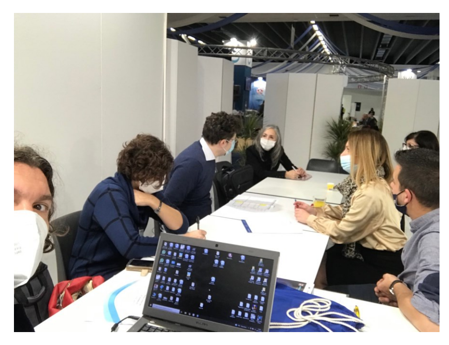
Figure 3 Final event at Sealogy (Ferrara, IT)