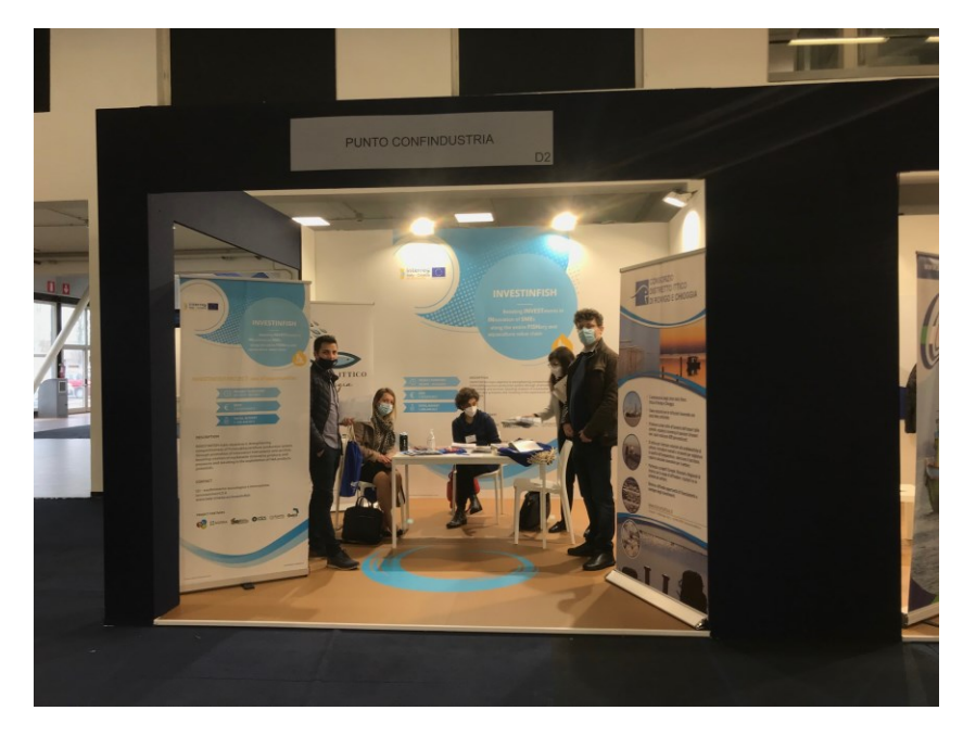
Figure 2 Final event at Sealogy (Ferrara, IT)