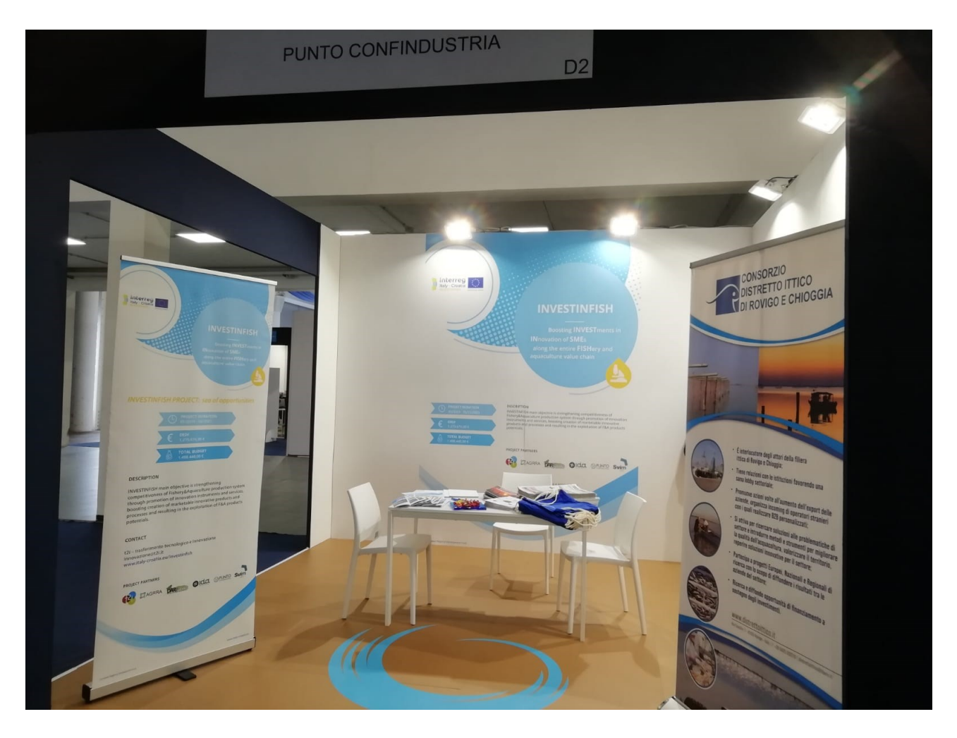
Figure 2 Stand Punto Confindustria in Sealogy (Ferrara)