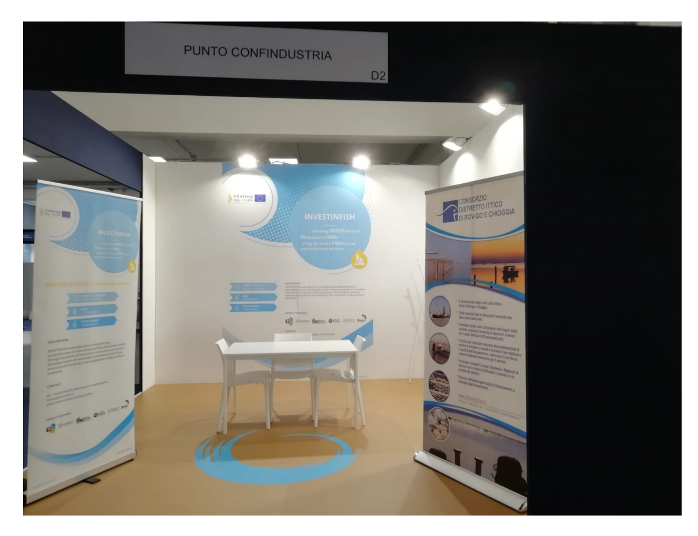
Figure 1 Stand Punto Confindustria in Sealogy (Ferrara)