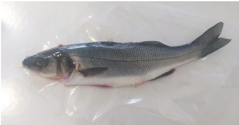
Figure 1: vaccum packed eviscerated sea bass tested for extended shelf life, UNIUD, 2021.

In addition, we wanted also to control the storage and the coservation of fresh fish products proposed through all production process: from farming to selling. This part consisted in controilling the time/temperature of the delivery and the packaging. The delivery from the farm to the lab, where the products were packaged, lasted 24 hour maximum and the gutted fish were kept in boxes with flake ice. At the Lab the fish were packaged within 2 hours and kept at 4 \text{ }^\circ\text{C} . The type of packaged included under vacuum and Modified athomsphere packaged. We studied and defined the best solution of the packaging to preserve quality and and healthy safe fish to customers.