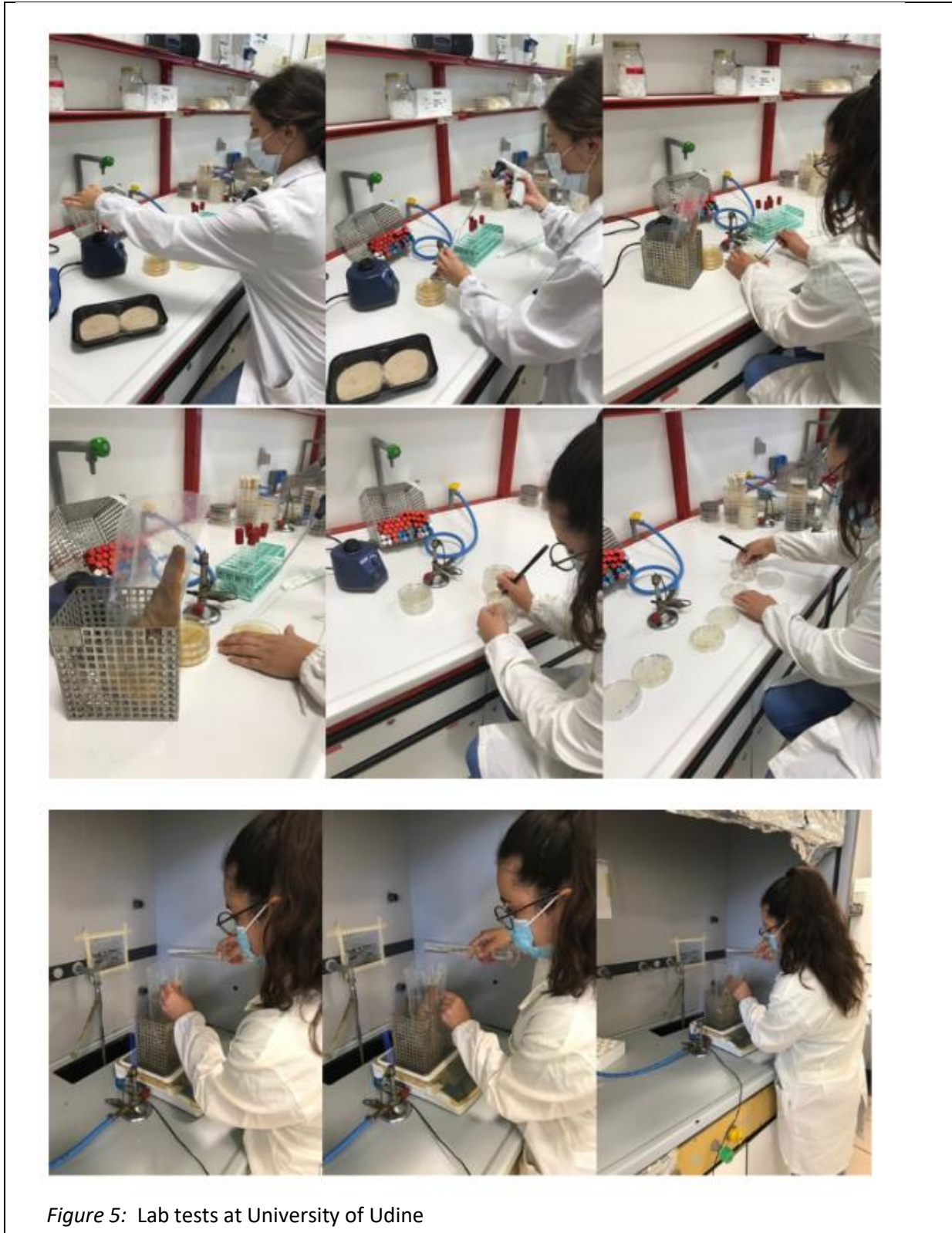
Figure 5: Lab tests at University of Udine