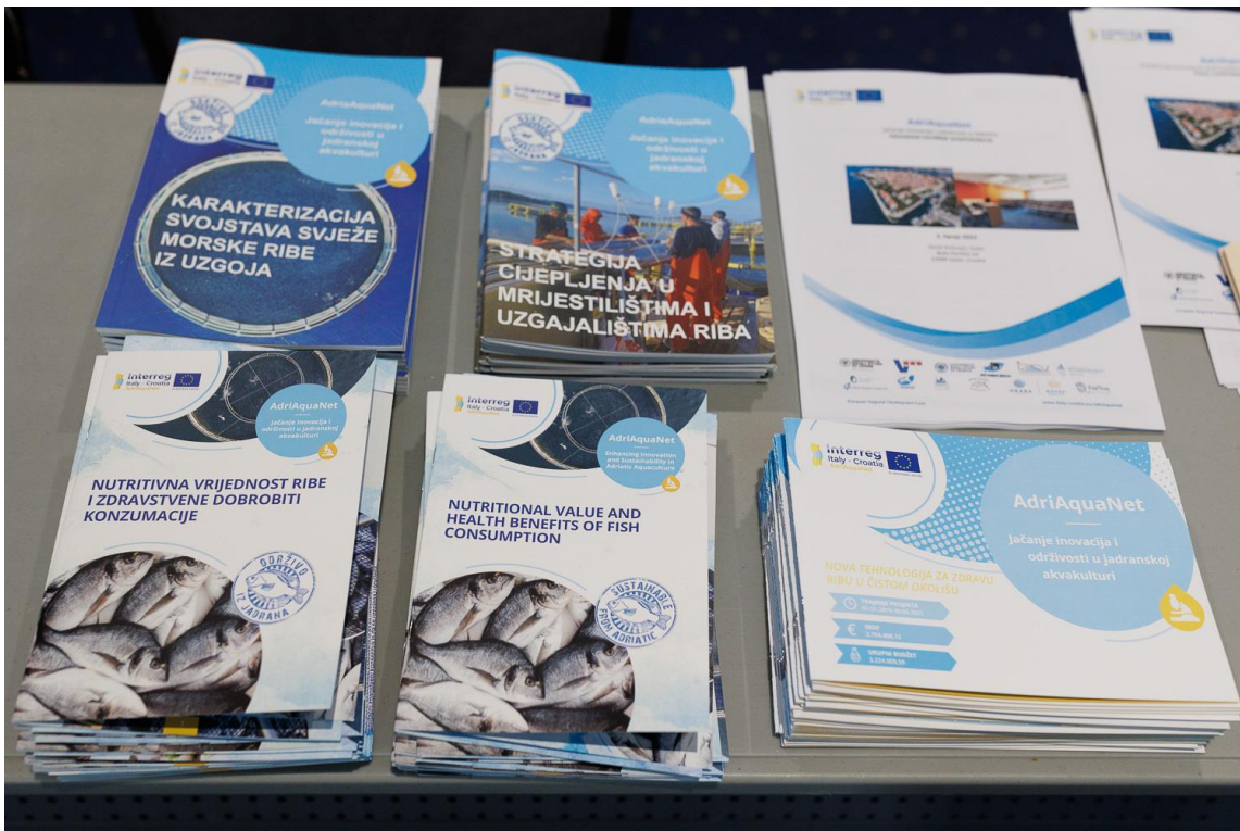
Figure 7: AAM produced and shown during AAN events.

The results of WP 5.2 activities were presented in several trainings, in particular in Padua (November, 19 th , 2021), in Pordenone (Aquafarm, May 25 th , 2022), in Ostuni (May 7 th , 2022), Zadar on 2 nd and final events in Zadar on 3 rd June 2022 and in Udine on 20 th June, 2022. The availability of the results for general public and other stakeholders on international level will be ensured by International publications. Besides, we have produced a large number of publications such as “The Manual of European Sea Bass and Gilthead Sea Bream Safety, Quality and Health Benefits.” (WP 5.1, LP and PP1 work) . This Manual was distributed in different workshops and Congress to stakeholders. Several brochures, publications and video promoting material have been prepared (WP 5.3, PP5 and PP2) and presented during 39 project events . In addition to these public events students of different university programs were reached with results of research carried out in the WP5; not only students of the faculties of project partners but also students of the Faculty of Food Technology, Biotechnology and Nutrition and Veterinary Faculty, University of Zagreb, Faculty of Food Technology, the University of J.J. Strossmayer in Osijek and Faculty of Agronomy and Food Technology, University of Mostar, Bosnia and Herzegovina, etc.