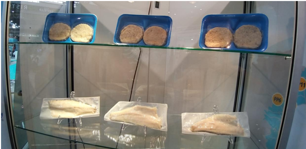
Figure 3: New products fillet and hamburgers, presented at the training in Pordenone, May 2022

The second aim was to produce new farmed fish products, such as fish hamburgers and fillet to increase the consumption of farmed fish species, based also on the surveys and the perception of different groups of consumers (general consumers, consumers in catering facilities and managers of marketing facilities) carried out in WP5.3 task, both Italy and Croatia. Preliminary activities were carried out by LP and the decision to develop a new product was switched from sausages to hamburger made of farmed sea bass and sea bream. Product as smoked fillet of sea bream and the sea bass was developed in collaboration with PP10 Orada (fish provider) and PP11 Friultrota (technique provider) and their quality analysed by LP labs.