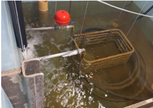
Picture 1 - Prototype water heater installed in Ittica Caldoli