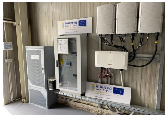
Picture 2 - heat pump equipment