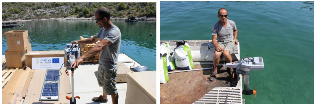
Picture 5 and 6 - emission free electrical outboards