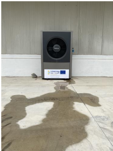
Picture 3 - heat pump engine

Thanks to the good results obtained with the prototype, Ittica Caldoli bought a second heat pump with a rated power of 17 kW and a new heat exchanger about 5 times bigger than the first one. The second version of the system was able to increase the water temperature from 19°C to 23°C in almost all the 10 tanks located in the hatchery, for a total water volume of about 280 m 3 . The results shown above clearly indicate that the heat pump technology, combined to clean energy production by means of renewable energy sources, is the key to improve the efficiency of water heating for inland mariculture.