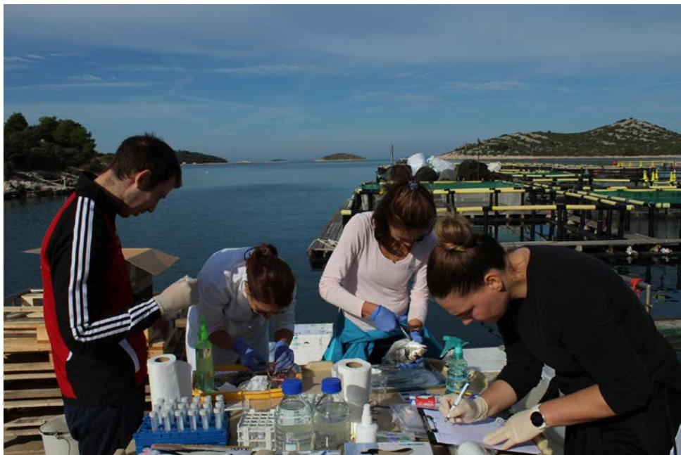
Figure 7,8 Friškina Farm feeding and testing with new feeds.