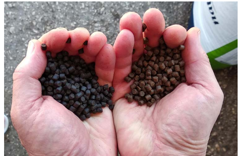
Figure 10 IZOR researchers' team with new feeds at Friškina farm in Rogoznica, Croatia