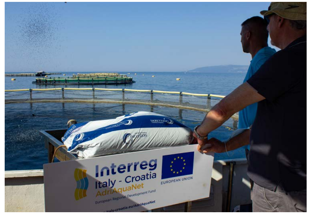
Figure 3,4,5,6 Friškina Farm feeding and testing with new feeds.