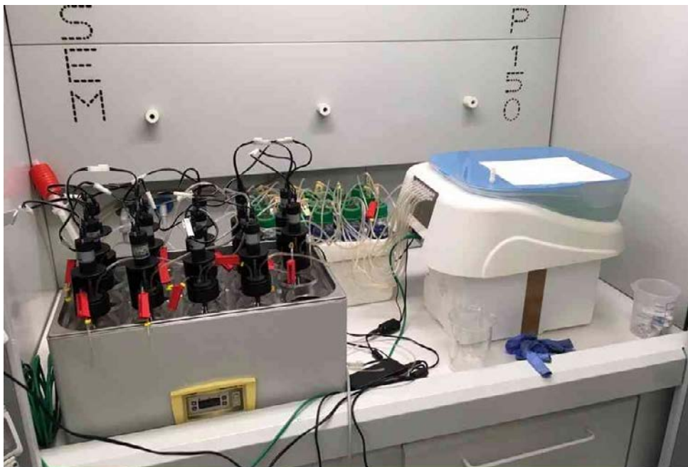
Figure 12 The Automatic Methane Potential System (AMPTS, by Bioprocesscontrol) for biochemical methane potential (BMP) determination (September 2019).