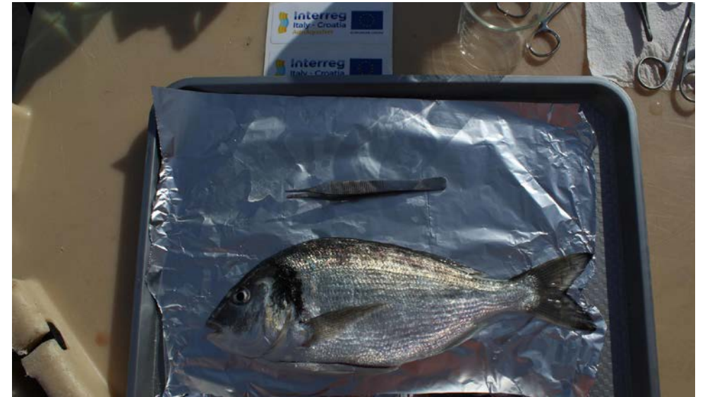
Figure 9 IZOR researchers' team with the AAN sea bream on sea at Friškina farm in Rogoznica, Croatia.