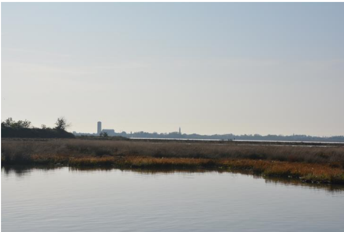
Torcello from the lagoon