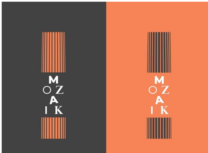
Logotype of the product club developed by the Municipality of Murter-Kornati

During 2021 individual meetings and phone calls with the stakeholders were organised by PP5 – Murter-Kornati, in parallel with interventions for the realisation of the Archaeological site Colentum, leading to the identification of the Product Club MOZAIK COLENTUMA.