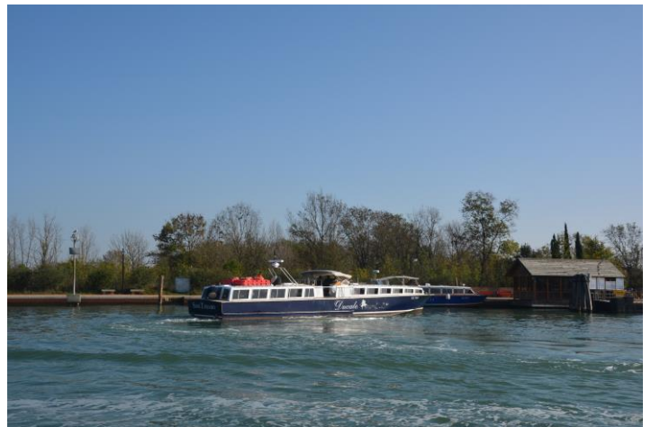
Imbarcadero of Torcello.