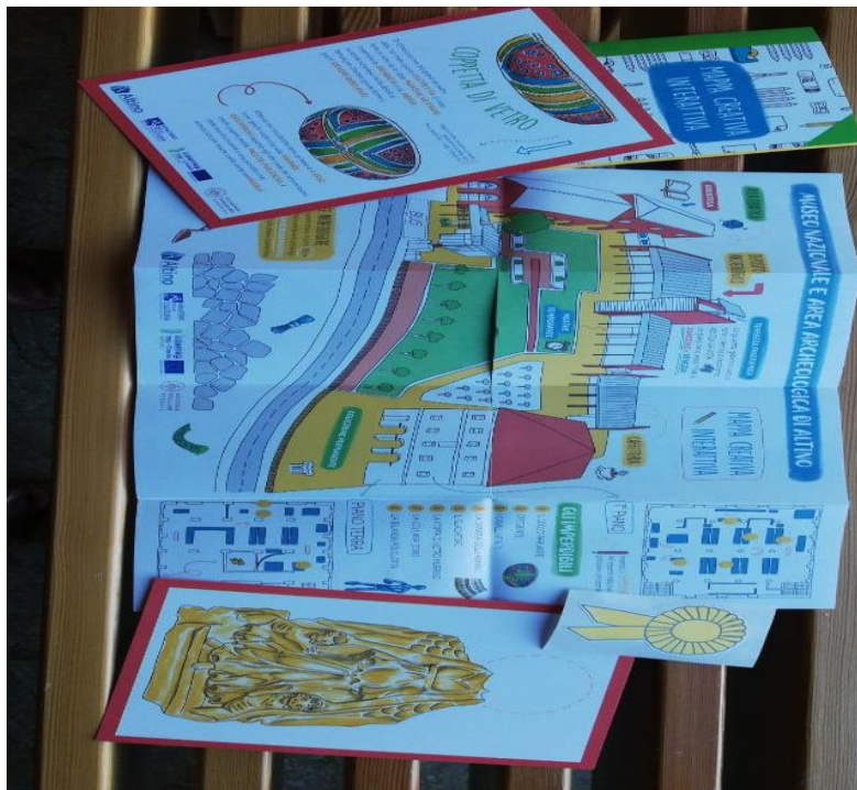
Printed materials for Altino Kids.

On this occasion, the material, as for the first time, proved to be very effective in making the visit to the museum fun and interesting for children from about six years of age. Postcards are also a fantastic memory / insight that boys and girls can take home for free.