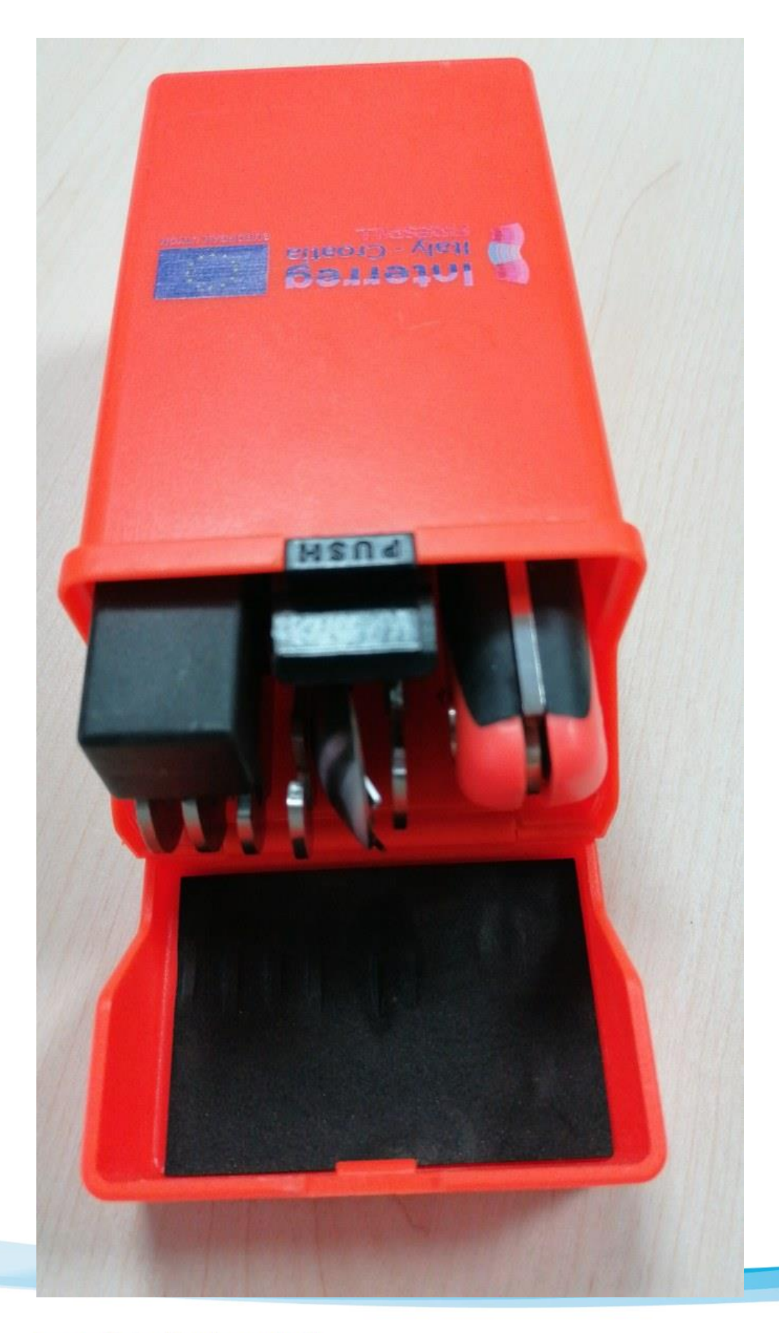
European Regional Development Fund