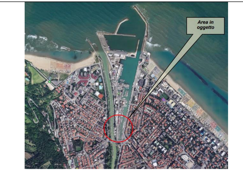
Localization of the area for the collection and managements of the waste

The Municipality of Pesaro is realizing the intervention, thanks to the grant received by the European Maritime and Fisheries Fund (EMFF), having applied to the regional call 1.43 of the programme. Marche Region is promoting the adoption of this protocol in other ports.