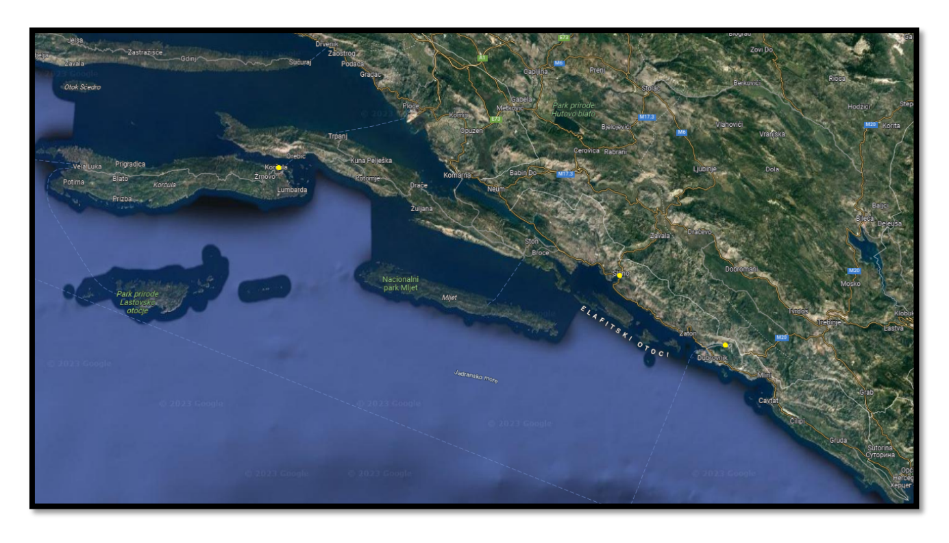
Figure 1 Detailed map showing the location of marinas of the Dubrovnik-Neretva County whose data has been collected in this second round

Table 1. The marinas of Dubrovnik-Neretva County recorded during the second round of data collection with related coordinates