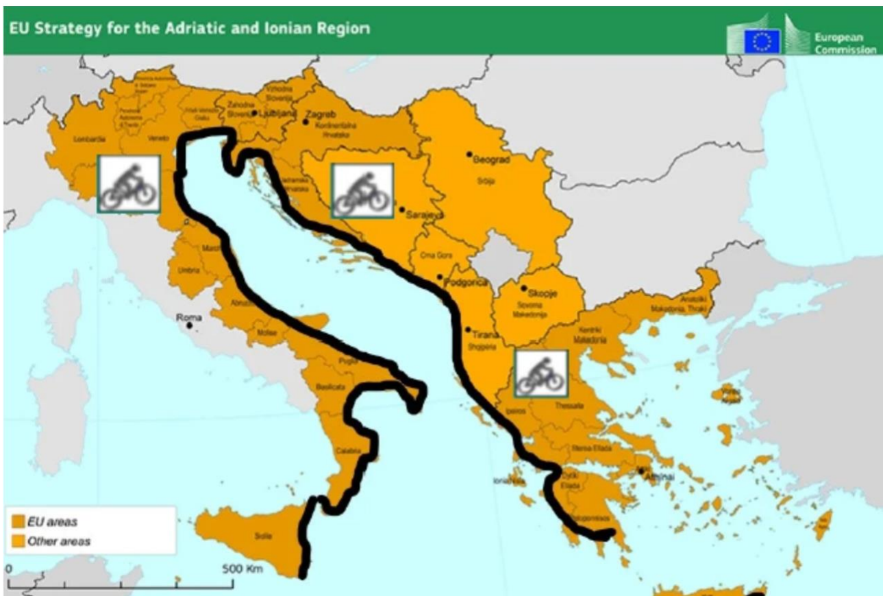
Fig. 2 - Adriatic Cycle Route (BI6) and the Croatian coast by EuroVelo 8 (Mediterranean Route)

that connects all the coast – it creates connections with the hinterland areas and capital cities, involving also the participating countries that do not face the sea basin. The ambition of the ADRIONCYCLETOUR is to create a pleasant transnational cycle route that is connected also with other means of transport for your return. It promotes historical, artistic, cultural, and naturalistic heritage of the region and develops the new trend of eco-tourism.