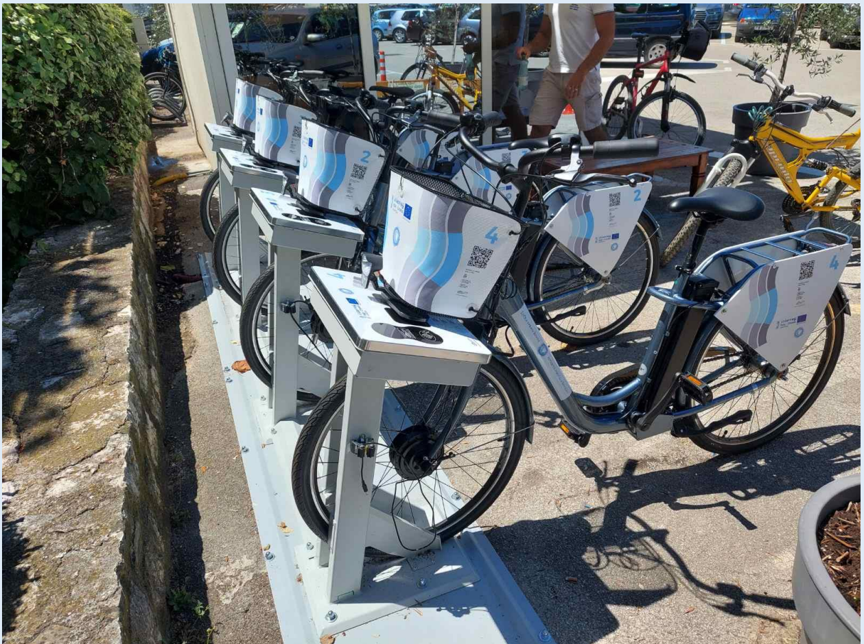
Installation of e-bikes