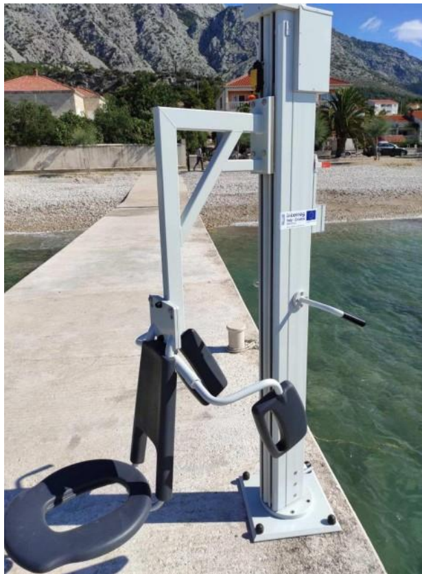
Figure 3: Aqua lifters implemented in some beach facilities in the Dubrovnik-Neretva Region