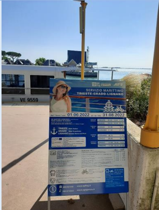
Figure 2 Promotional flyer, with timetables, costs and other infos.