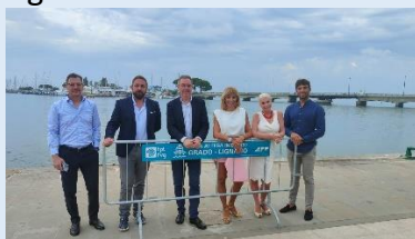
Figure 8 Representatives of TPL FVG, Vidalí Group, FVG Region, Municipality of Grado and Municipality of Lignano at the peer of Grado, 1st July 2022.