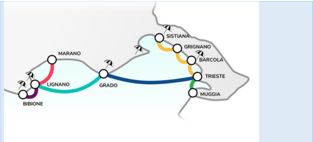
Figure 1 Overview of the maritime connections in Friuli Venezia Giulia Region in summer 2021 and 2022. In light green the maritime line Lignano Grado, cofinanced by the MIMOSA project.