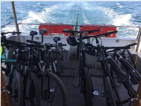
Figure 6 Bikes on-board (Lignano-Grado line)