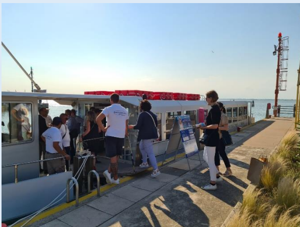
Figure 5 Passengers arriving in Lignano