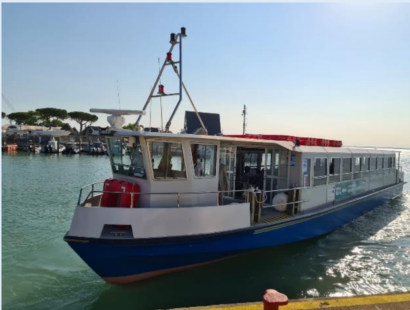
Figure 3 Boat Lignano-Grado (Vidali Group)