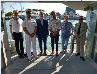
Figure 7 Representatives of FVG Region, Vidalí Group, TPL FVG and Municipality of Lignano at the peer of Lignano, 1st June 2022