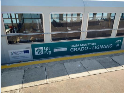
Figure 4 Boat Lignano-Grado (Vidali Group)