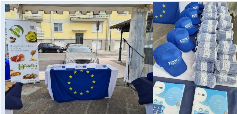
Figure 9 FVG Region stand at the pier of Grado, 1st July 2022