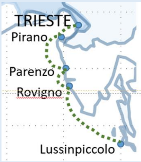
Figure 2 Overview of the cross-border maritime connections in Friuli Venezia Giulia Region.