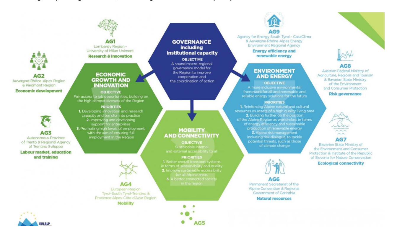
EUSALP objectives and priorities

The Commission, for its part, acts as an independent facilitator and participates in the overall coordination of the strategy, while there are also national coordinators in place and a yearly rotating Presidency. All these structures were swiftly initiated during the first year when the actions groups began work, meeting several times per year<sup>3</sup>.