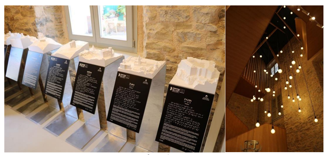
House of Castles - interior

All contents are available in 5 languages: Croatian, English, Italian, German and Slovenian. The following castles are included in presentation: Momjan, Pietrapilosa, Pazin, Savičenta - Morosini Grimani, Dvigrad, Grožnjan, Kršan, Paz and Posert, Žminj, Završje.