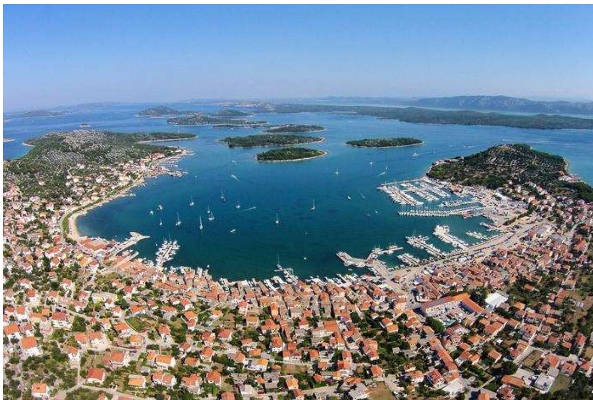
Figure 1. Murter

Open-air Museum “Murter’s views” is located in the position of Gradina near the settlement of Murter. According to the latest census, there are 1,920 inhabitants in Murter. The settlement was formed in the Middle Ages, and it was first mentioned in 1273 as a rural settlement (then two settlements were formed: Villa Magna (“ Veliko selo ”) – today’s Murter and Jezera).