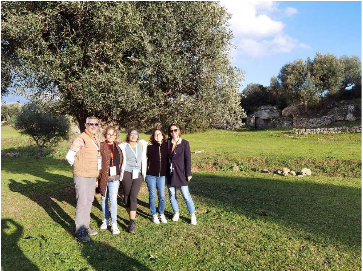
Tour Operators from Sweden, India, Denmark, Peru

4 Tour operator coming from Sweden, India, Denmark and Peru, have chosen “Cultural Route in the Lands of Fasano” with a positive feedback about the travel experience.