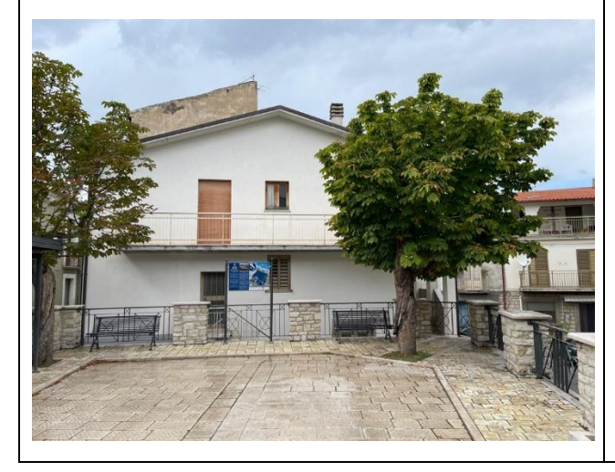
San Felice (and Mayor)