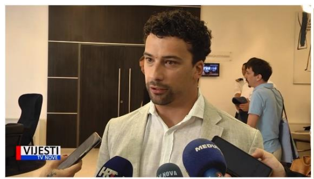
Ž domačin Regionalne radionice o Prekograničnom planu upravljanja morskim otpadom