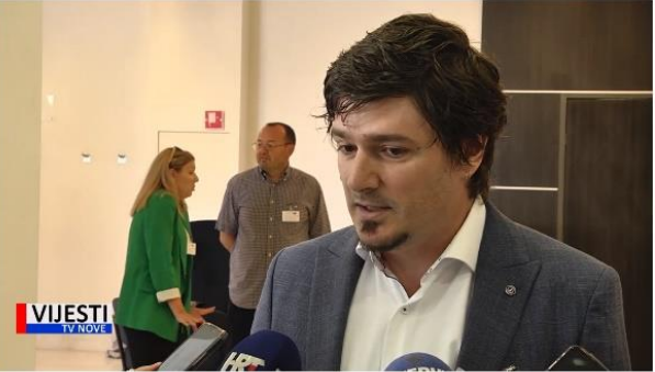
Vijesti TVN - IŽ domaćin Regionalne radionice o Prekograničnom planu upravljanja morskim otpadom