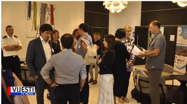
Vijesti TVN - IŽ domaćin Regionalne radionice g Prekograničnom planu upravljanja morskim otpadom