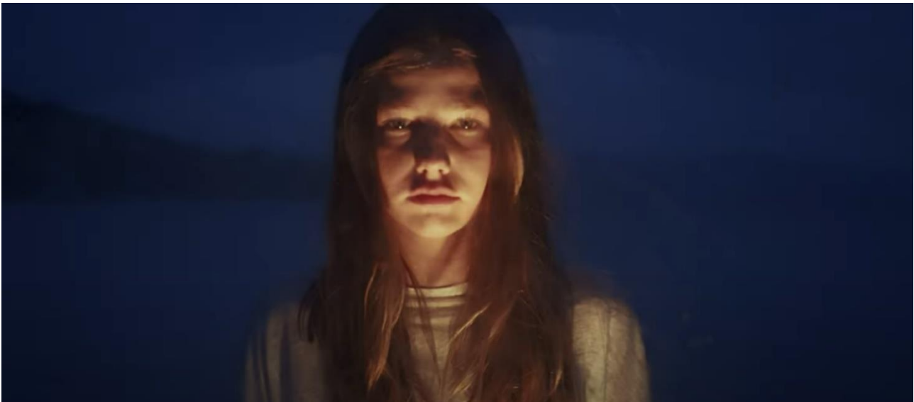
Figure 5: Promo video – call for action (IRENA)

Promo video: The aim of the video is to make viewers aware of the problem of marine litter. In order to achieve the desired impact on the viewers, the film will use the effects of drama and seriousness due to the situation in which the oceanites are located and the consequences they will have on humanity. The film wants to send a message that the animal and plant species that make the seas and oceans their home are not separate from humans and that correct actions start from the individual (call to action).