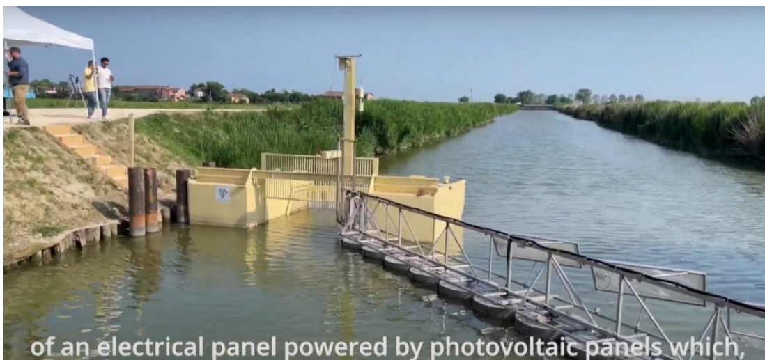
Figure 1: Short video related to regional activities with specific focus of inauguration of river barrier (ARPA Veneto)