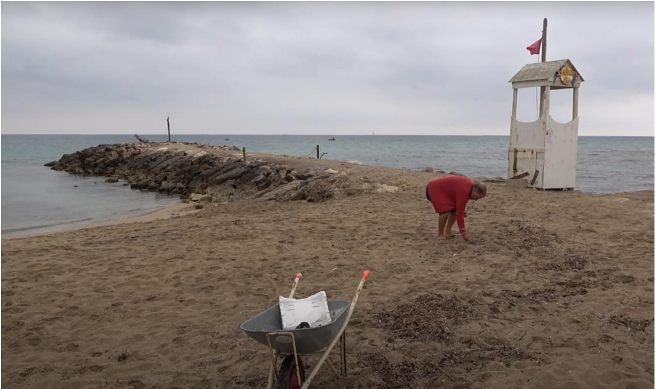
Figure 3: Activities with beach concessionaires (PP10 – Region of Puglia)

Region of Puglia prepared a short movie about activities with beach concessionaires .