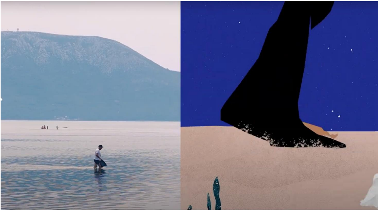
Figure 4: Start your day with the change – less plastic (DUNEA)

PP3 – DUNEA prepared one short promotional video with message “start your day with the change – less plastic” .