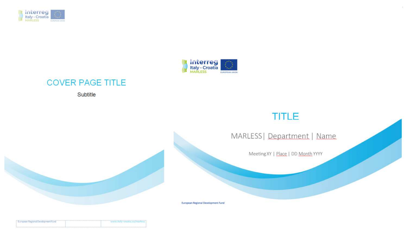
Figure 1 Project office pack