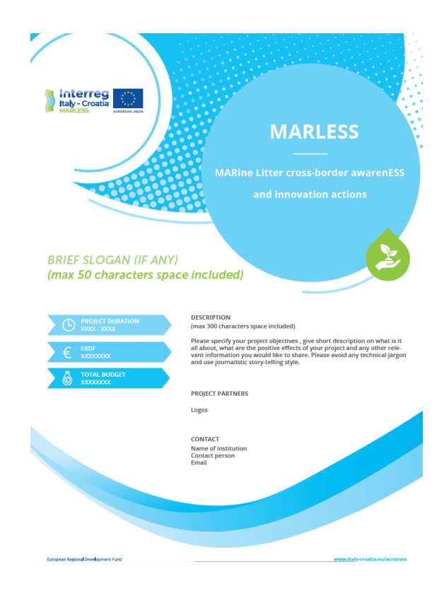
Figure 4 Project poster