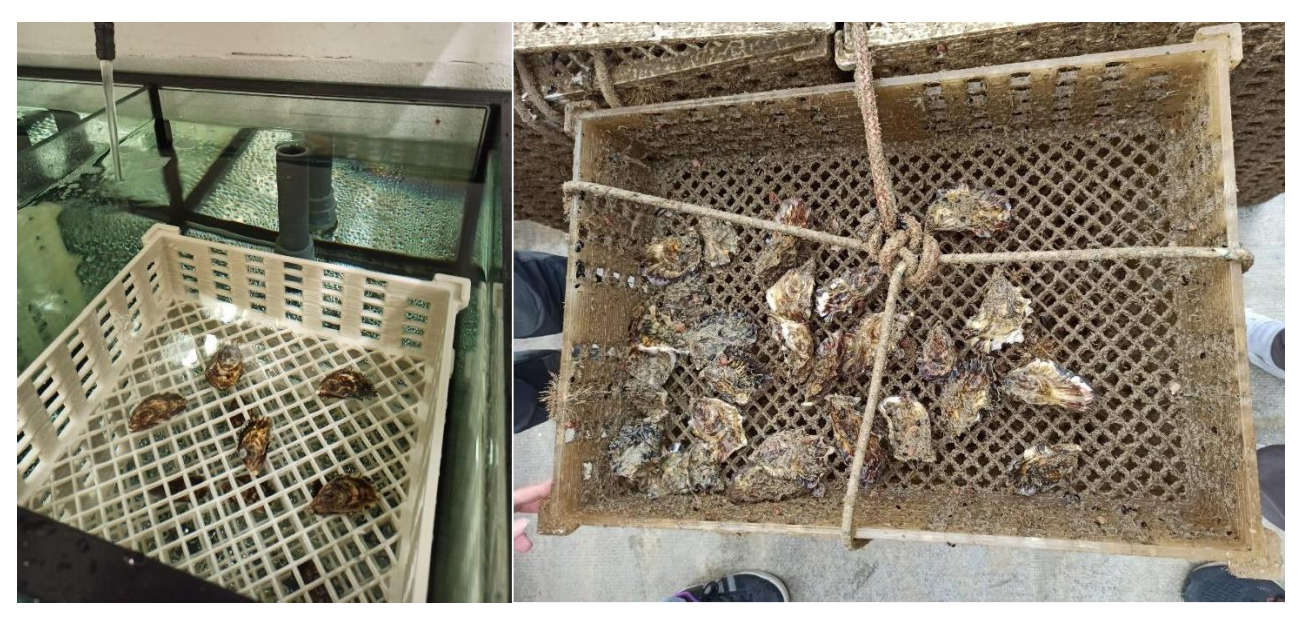
Figure 7 : Bioplastic baskets for oyster farming, produced by WASP company during the FEAMP project.

To buffer the problem of marine litter from aquaculture, in addition to these practical solutions upstream of the use of materials in aquaculture with the aim to replace existing ones, there is anotherpoint on which action can be taken, downstream of their use: improving the management of marine waste at municipal level.