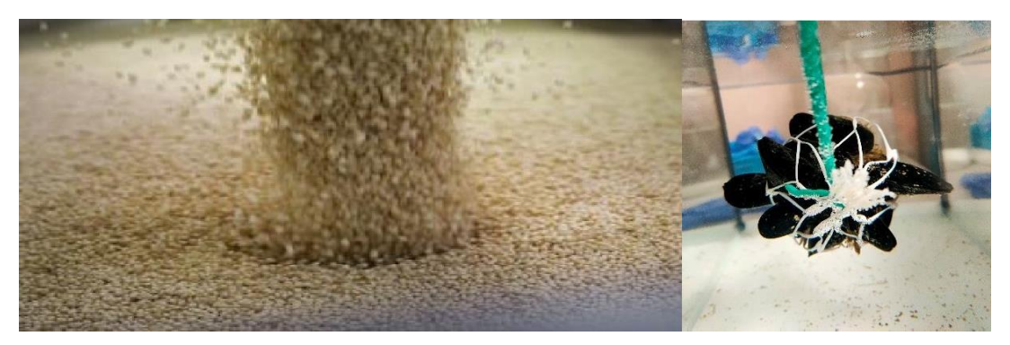
Figure 6: Mater-Bi or biopolymer materials produced by Novamont company partner of the Life_Muscles project.

DeFishGear and Interreg MI-Repair aim to provide a first global assessment of the quantities and types of marine solid waste in the Adriatic Sea, applying the same monitoring protocols and methodologies throughout the basin, raising awareness of the parties involved in the problem (fishermen, authorities, population, etc.) to prevent the production of marine litter and implement practical actions to reduce it. An EMFF funded European project carried out by Unibo in the Emilia Romagna Region consisted of validating an oyster production protocol in off-shore shellfish farms using bioplastic supports printed by 3D printer and made of PLA polylactic acid and PHB poly- \beta -hydroxybutyrate that have replaced the common baskets used in oyster farms made by polypropylene (Fig.7).