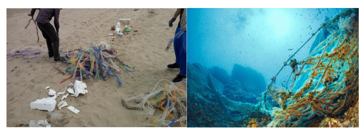
Figure 3: Beach and marine seabed, the two place where see more waste.

Moreover, at the top of the places "where they have seen more this type of marine litter", there are the beaches followed by the seabed (Fig.3).