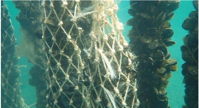
Figure 5: A sock in sisal to grow mussel.

Another viable alternative for replacing traditional plastics in the production of these applications is biodegradable and compostable plastics. Some biodegradable thermoplastic plastics can be processed with the same technology used for traditional plastics, making their production from an industrial point of view relatively simple. At the end of their life cycle, net made from compostable material could be collected and sent to composting plants for the production of quality compost for agricultural use. Moreover, their inherent biodegradability represents a mitigation of the ecological risk in case of dispersion at sea. Pilot studies have been launched in several European countries to reduce the marine plastic pollution generated by the aquaculture sector through the development of innovative biodegradable materials.