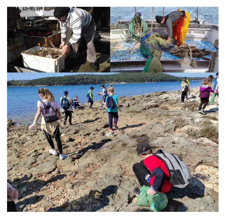
Figure 4 : At the top, fishermen who collect waste from the nets; at the bottom; children involved in beachcleaning activities.

The biggest and practical contribution that could come from stakeholders is to replace the plastic materials used with other alternative materials and systems biodegradable/recyclable that is a target of many projects.