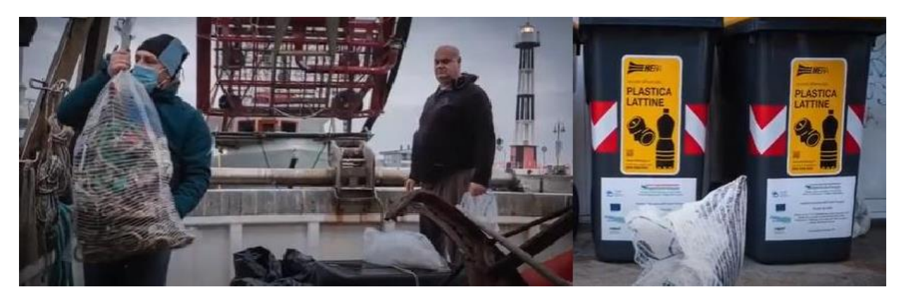
Figure 8 : Fishermen landing marine litter at the port of Cattolica and bins intended for the collection of this waste used during the FLAG project.

The suggestions provided by the interviews and the examples of possible solutions in the testing phase and/or already tested, collected in this report could be used design potential strategies and policies to improve the awareness of marine litter and sustain initiatives in finfish and mollusk supply chain aimedto reduce the impact of aquaculture sector on marine litter.