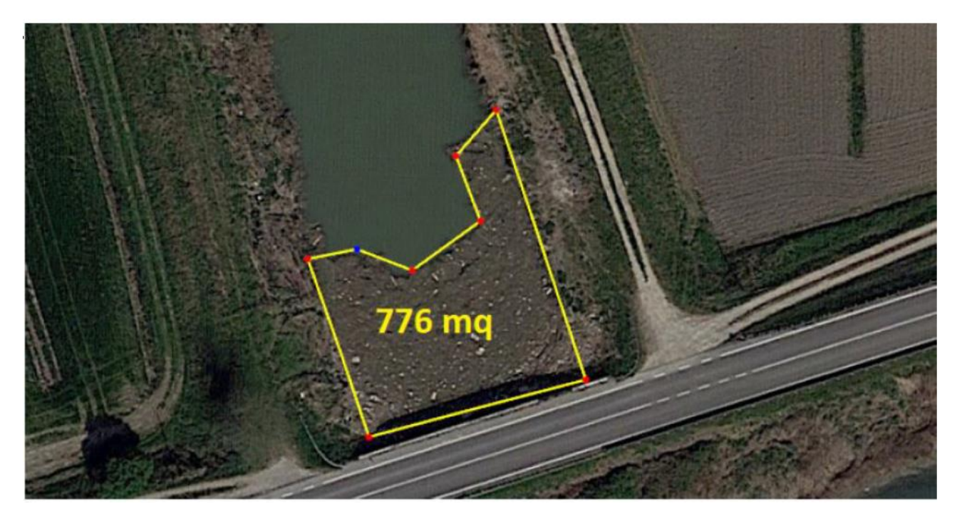
Figure 2: Floating litter accumulation on the Vela Channel.