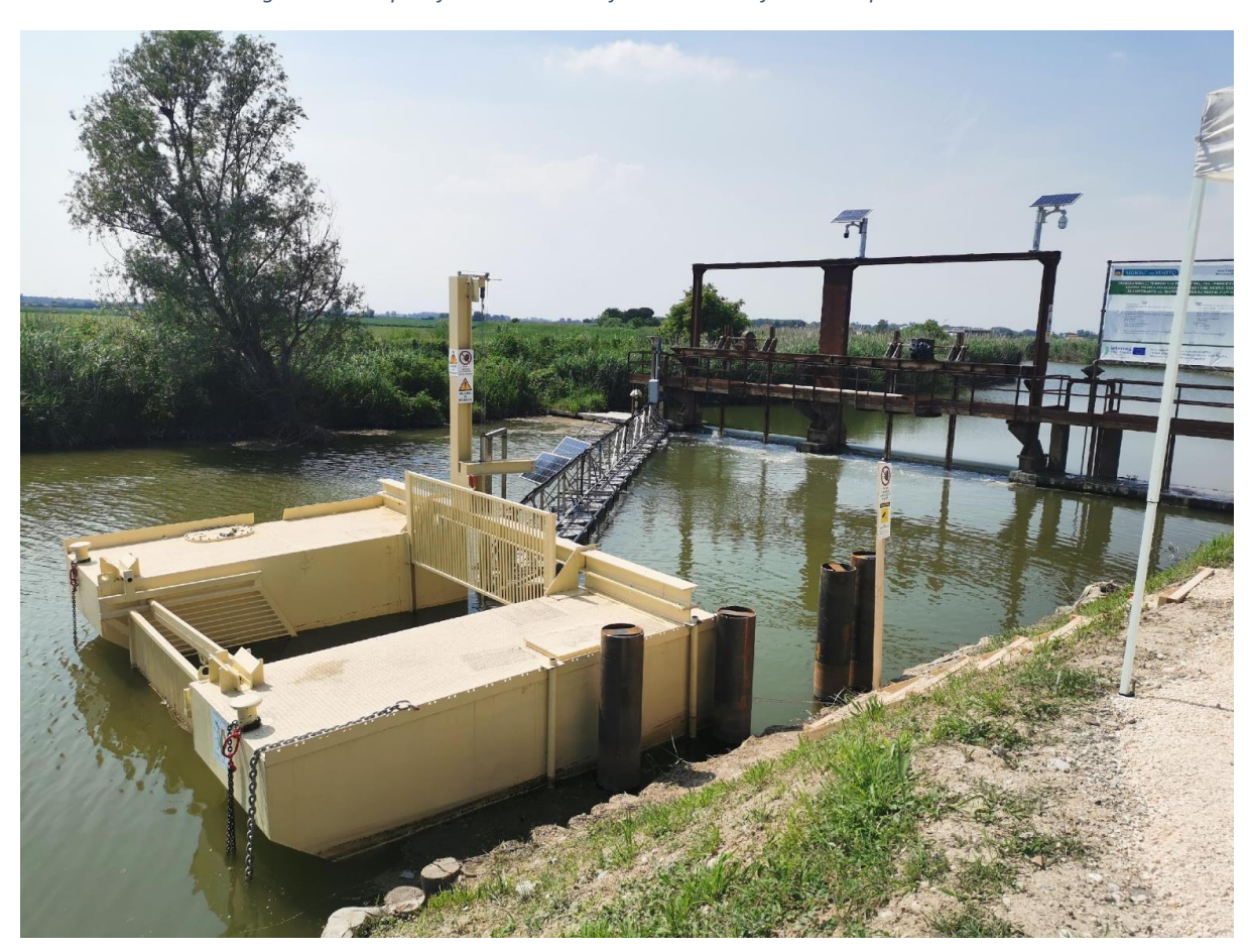
Figure 5: Pilot site with devices in place.