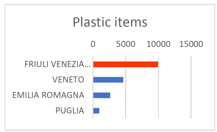
Figure 3: Comparison of the number of plastic items found

The data analysis showcased that Friuli Venezia Giulia region presents the highest number of plastic items compared to the other areas involved. Furthermore, tobacco products and non-classified items represent a huge portion of marine litter. In Friuli Venezia Giulia, aquaculture contributes to boosting marine litter.