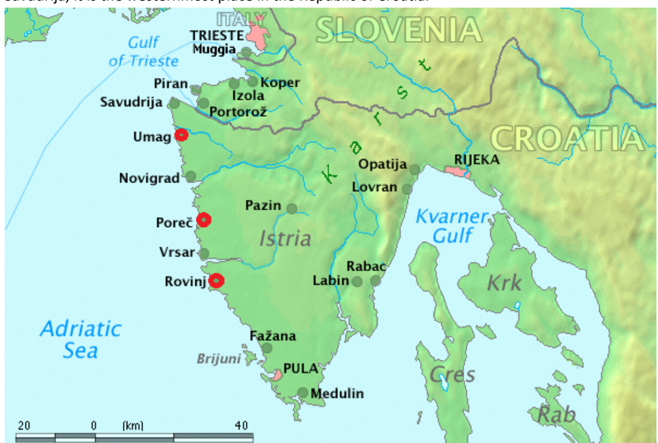
Figure 2: Map of deliverable locations

Umag is a city on the western Istrian coast, only 10 km from the Slovenian border and next to Savudrija, it is the westernmost place in the Republic of Croatia.