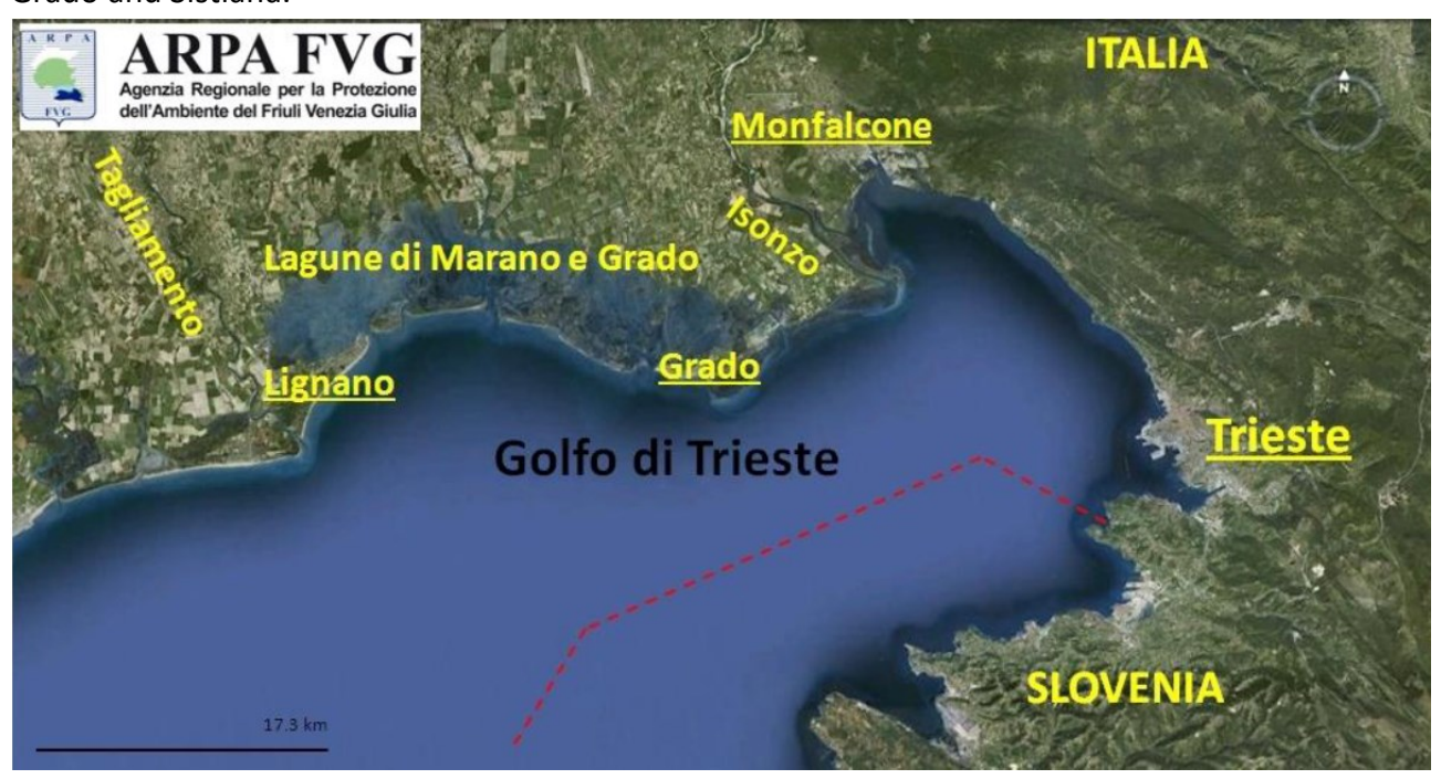
Figure 1: ARPA FVG: http://cmsarpa.regione.fvg.it/cms/tema/acqua/acque-marino-costiere-e-lagunari/approfondimenti/Acque-marino-costiere-e-lagunari-il-territorio.html

The cleaning-up activities in Friuli Venezia Giulia were respectively held between the summer of 2021 and 2022 (July-September), and involved beach concessionaires from Lignano Sabbiadoro, Grado and Sistiana.