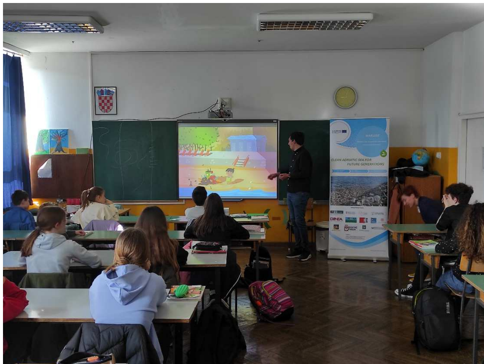
Figure 4. Students watching the video during educational workshops (Labin)