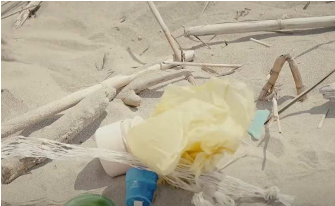
Figure 5: Videos shows beach pollution