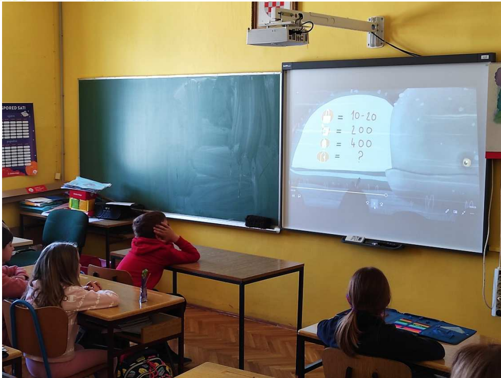
Figure 3. Students watching the video during educational workshops (Medulin)