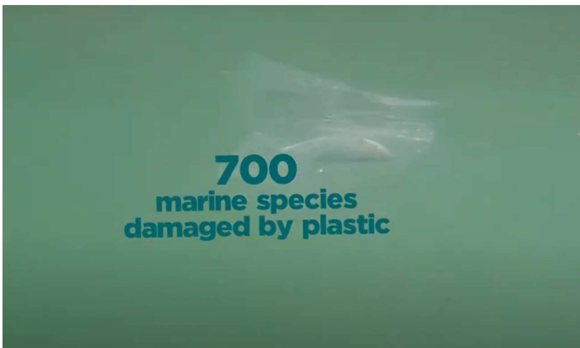
Figure 6: Video give some facts related to marine litter pollution