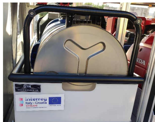
Figure 1. Firefighting container and firefighting equipment