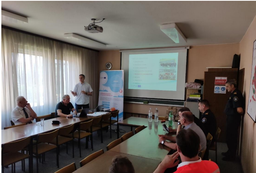
Figure 2. Presentation of the purchased equipment and education in the civil protection and flood protection sectors