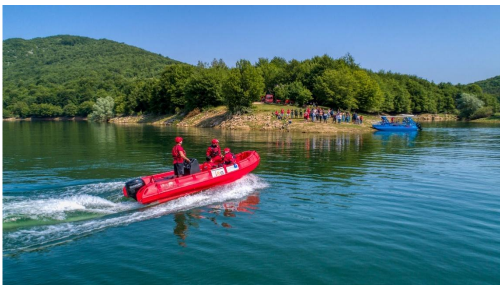
Figure 4. Professional education and demonstration exercise on the Lika river