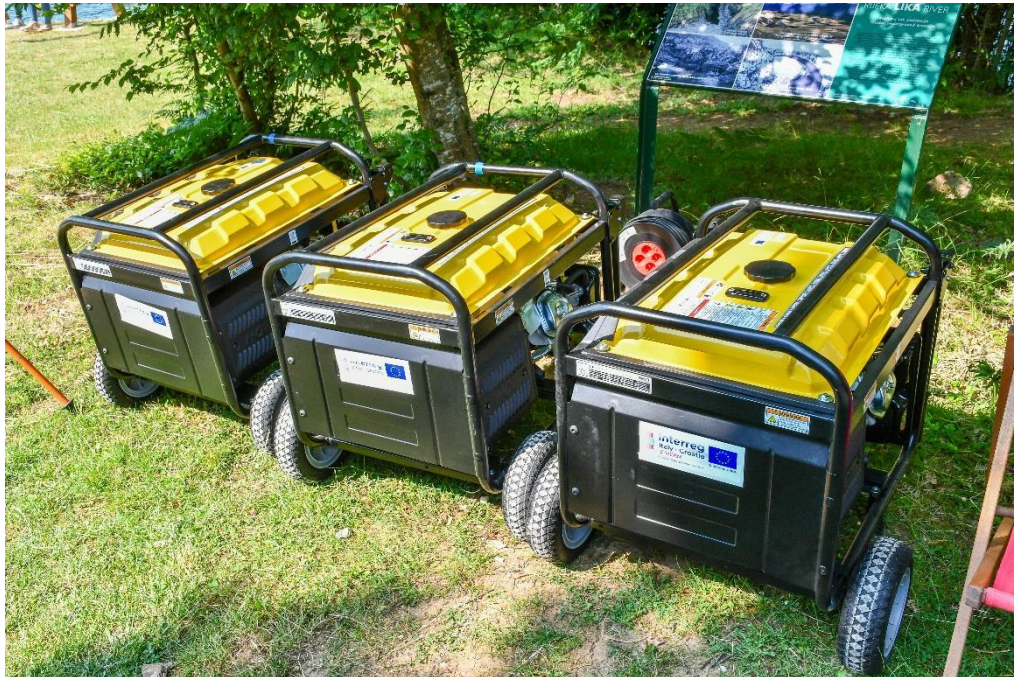
Figure 3. Purchased equipment – Gospić

On 26 th and 27 th June 2023, professional education in the civil flood protection sector and demonstration exercises were held and equipment acquired through the STREAM project was presented. The goal of the demonstration exercise on the Lika River was the presentation of the preparedness and response of the participants and operational forces of the Civil Protection system, the presentation of equipment and the implementation of civil protection measures and activities.