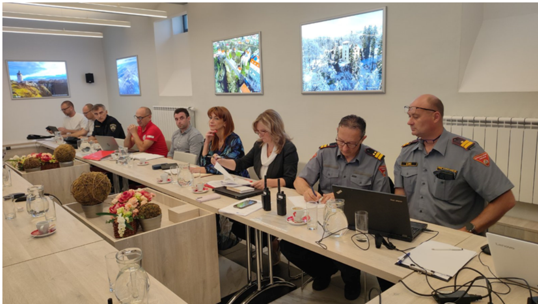
Figure 1. As part of the final exercise, 1 test of equipment and systems in KAZUP was carried out

As part of the final exercise, 1 test of equipment and systems in KAZUP was carried out. The exercise started with the notification of the Civil Protection Center 112, via SMS. The connection and operation of the telemetry system, video surveillance system, siren system and radio communication system using radio stations (TETRA device) are shown through the geoinformation system.