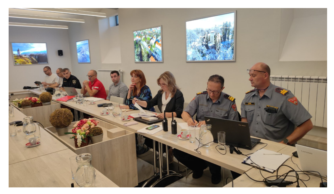
Figure 1. As part of the final exercise, 1 test of equipment and systems in KAZUP was carried out

As part of the final exercise, 1 test of equipment and systems in KAZUP was carried out. The exercise started with the notification of the Civil Protection Center 112, via SMS. The connection and operation of the telemetry system, video surveillance system, siren system and radio communication system using radio stations (TETRA device) are shown through the geoinformation system.