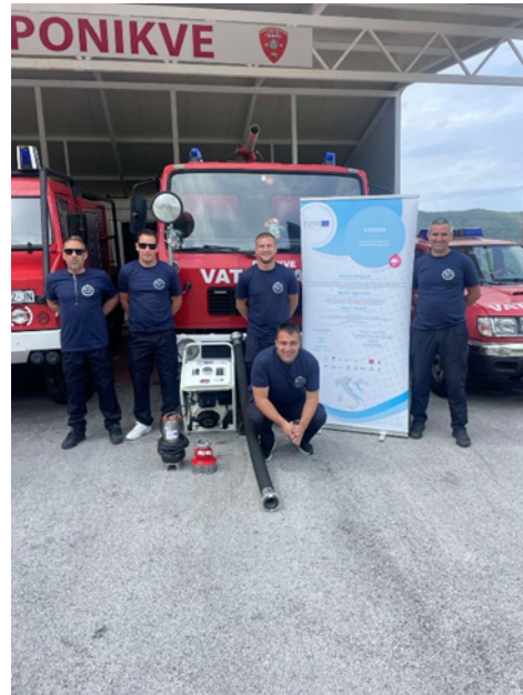
Figure 4. Training drills with purchased equipment in Ponikve

The fourth training drill for the civil protection systems members for the operation and testing of the equipment was organized on May 27 st 2023 in Metković.