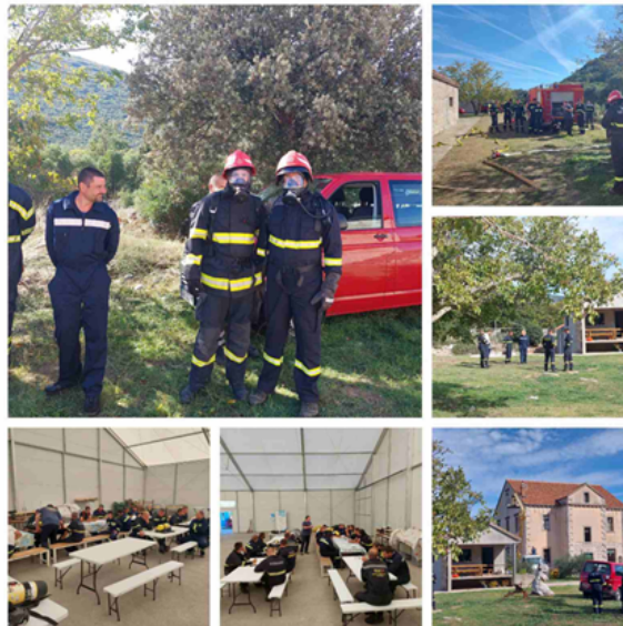
Figure 3. Training drills with purchased equipment in Putnikovići (Pelješac)

The third training drill for the civil protection systems members for the operation and testing of the equipment was organized on March 31 st 2023 in Ponikve.