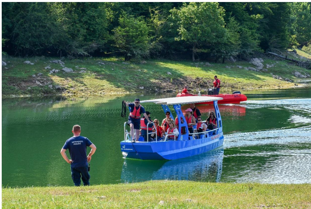
Figure 8. Training drills with purchased equipment on the Lika River