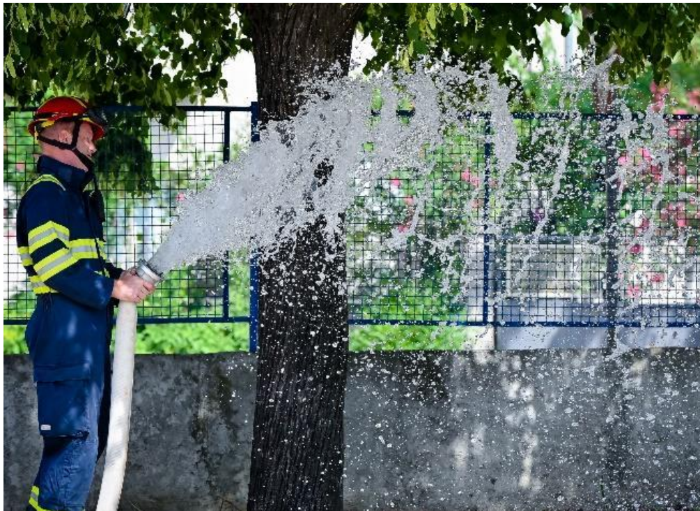
Figure 1. Training drills with purchased equipment in Zadar