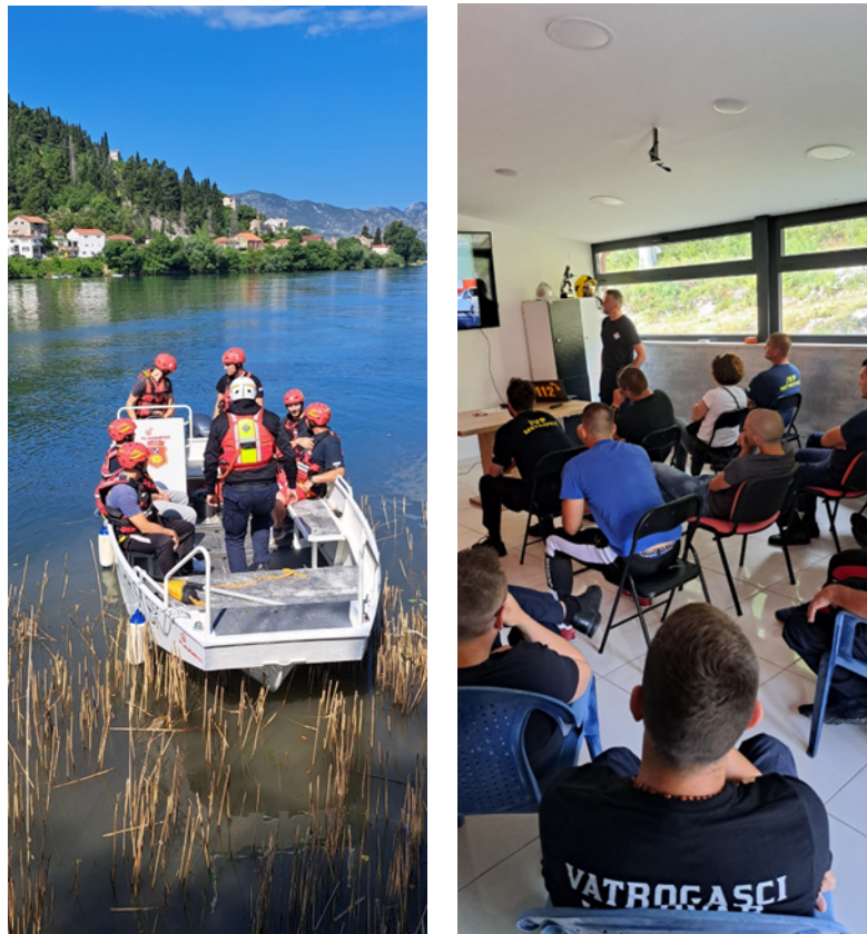
Figure 5. Training drills with purchased equipment in Metković

And the last, fifth training drill for the civil protection systems members for the operation and testing of the equipment was organized on June 24 st 2023 in Župa Dubrovačka.