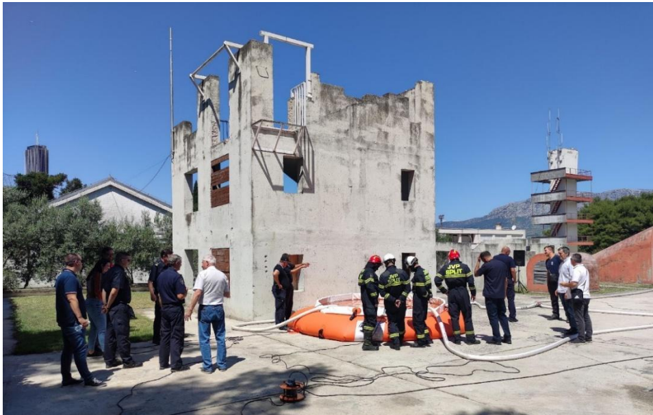
Figure 7. Training drills with purchased equipment in Split