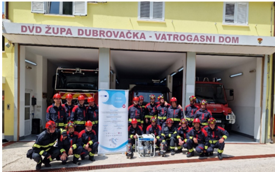
Figure 6. Training drills with purchased equipment in Župa Dubrovačka