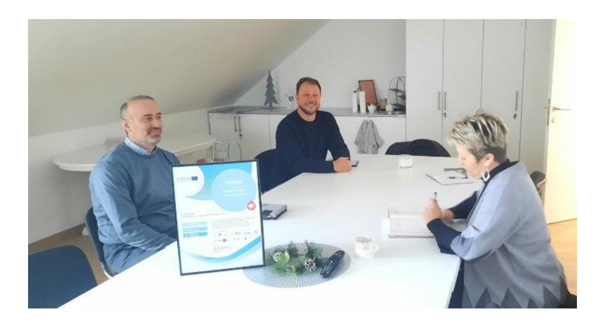
PP12 PP12 Karlovac County produced a total of two (2) posters during the project.

Public Institution Development Agency of Lika-Senj County – LIRA produced a total of two (2) posters during the project.