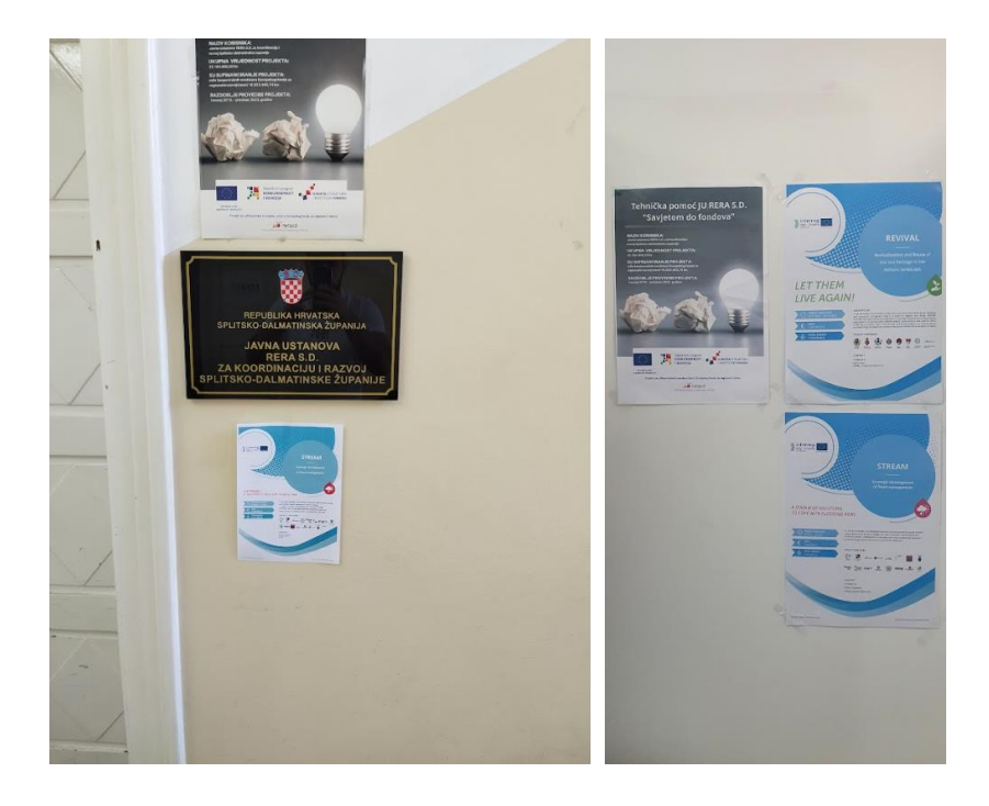
PP3 University of Zadar produced a total of five (5) posters.

During the project, Public Institution RERA SD for Coordination and Development of Split Dalmatia County produced a total of two (2) posters.