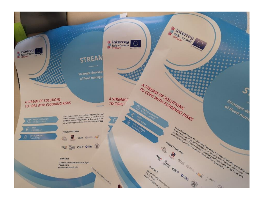
PP1 Dubrovnik-Neretva County produced a total of four (4) posters.

During the project, LP ZADRA NOVA produced a total of five (5) posters.