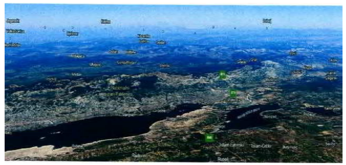
Figure 2. The Velebit Channel in Zadar County is connected by the Novi Gorge to the Novigrad Sea, which is connected to the Karin Sea via the Karin Gorge.

The area of the Novigrad Sea and the Velebit Channel geomorphologically belongs to the areas of Ravni kotar, Velebit and the island of Pag (Figure 2), between which there are sea surfaces that are suitable for the cultivation of shellfish.