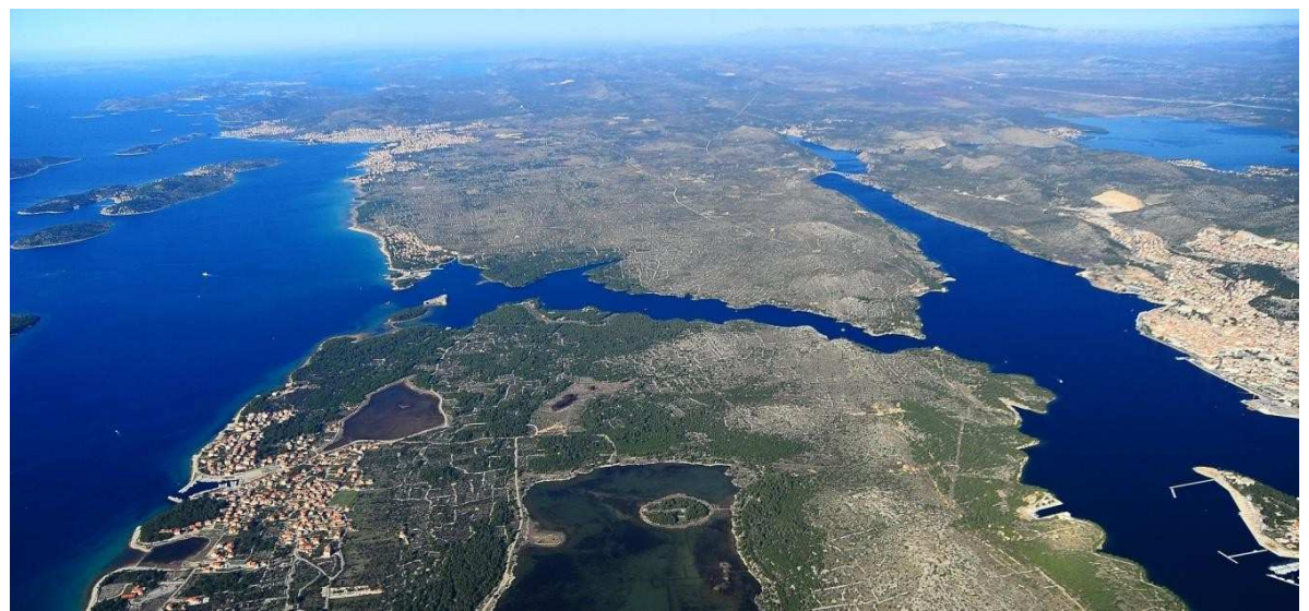
Figure 5. The lower Krka estuary from St. Ante Channel (center) that exits to the Adriatic sea to Prokljan lake (upper right)

The river Krka estuary is located in the Šibenik-Knin county in the central part of the Croatian coastline. It is a 22 km long sunken river valley with an average slope of 1.6 m/km. It is defined as the body of water extending from the base of the Skradin waterfalls (Skradinski buk) until the estuarine mouth. The estuary is relatively narrow, except for two wider parts: Prokljan Lake and the Šibenik area. The depth gradually increases from 1-2 m below the waterfalls to 43 m near the estuarine mouth. The maximum tidal range is around 40 cm at the mouth and 30 cm at the head of the estuary.