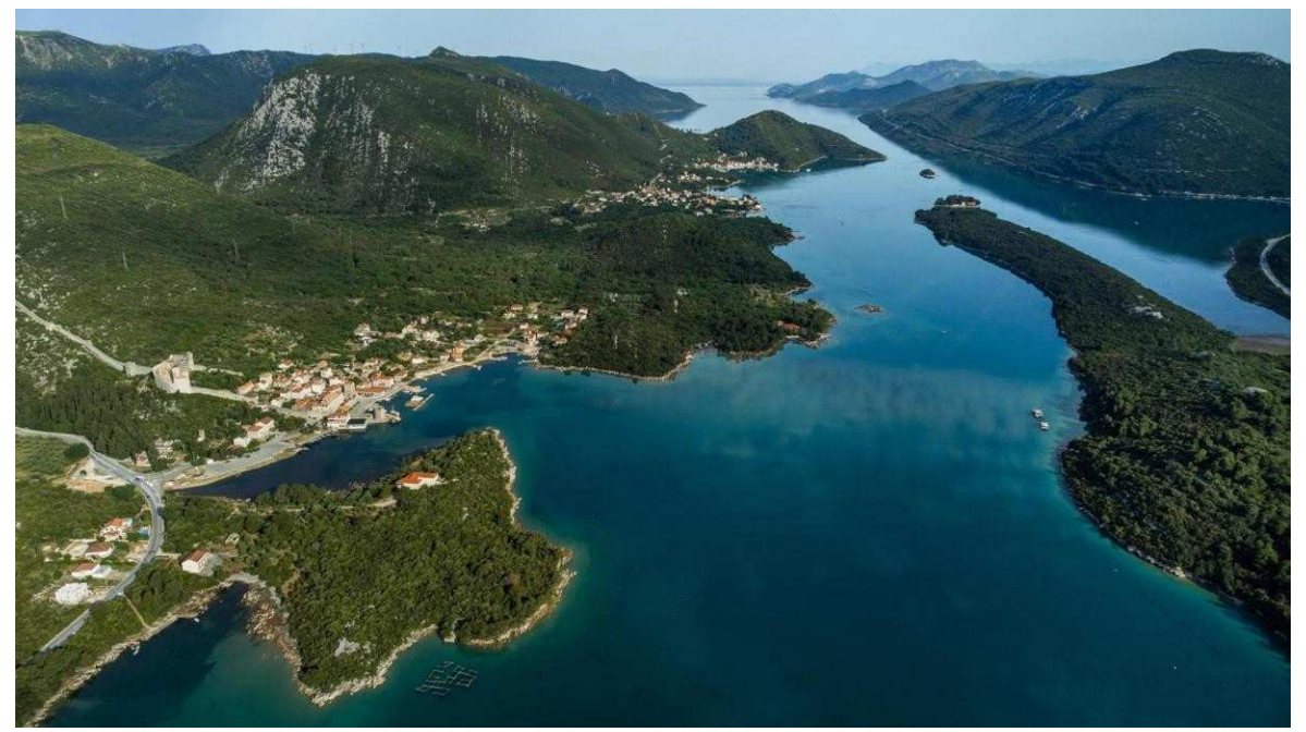
Figure 1. Aerial view of Mali Ston bay interior (source: https://www.vecernji.hr/vijesti/akcijaciscenja-malostonskog-zaljeva-okupila-je-50-ronilaca-1609406/galerija-522143?page=3).