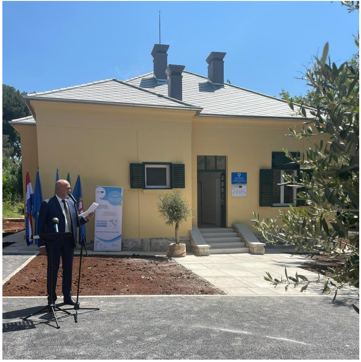
Inauguration speech of the renovated centre (May 2023)