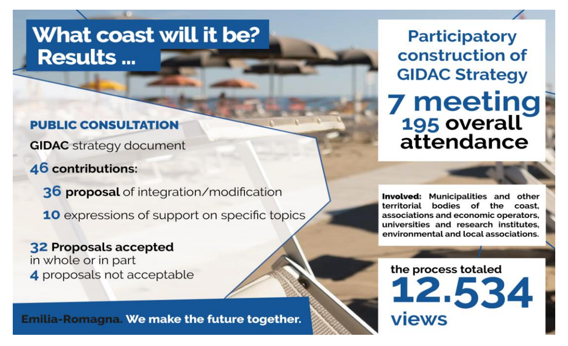
Figure 2. Who was involved and main steps of the Participatory Process building the Vision and the Strategy