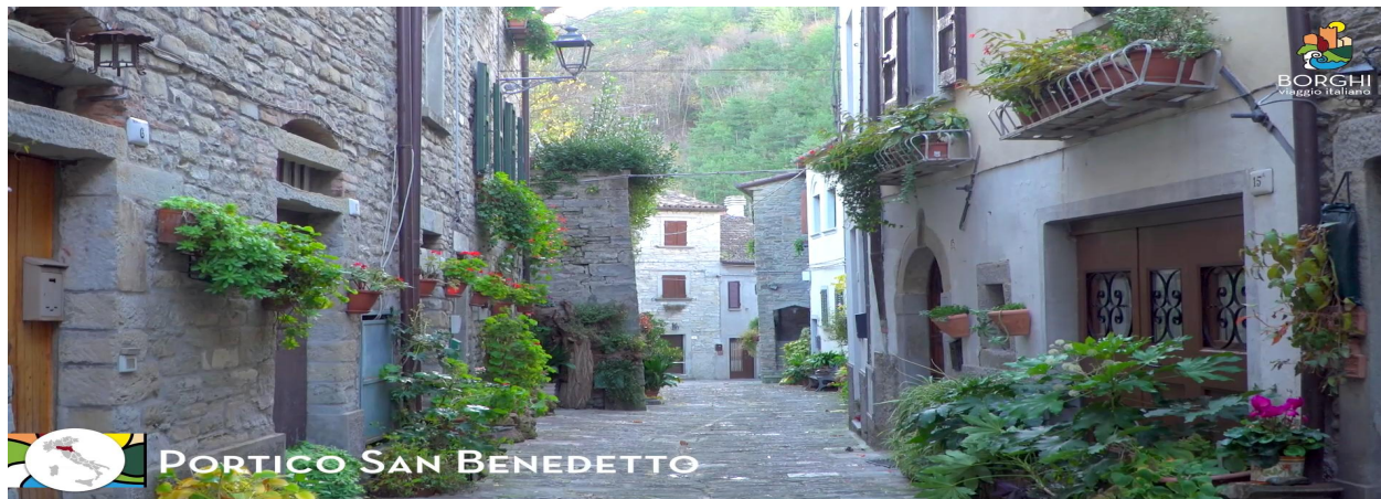
PORTICO SAN BENEDETTO