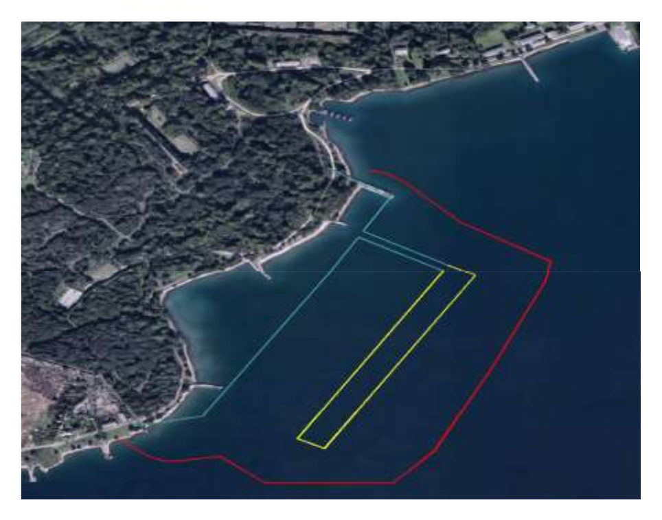
Figure 7: The area of the examination works