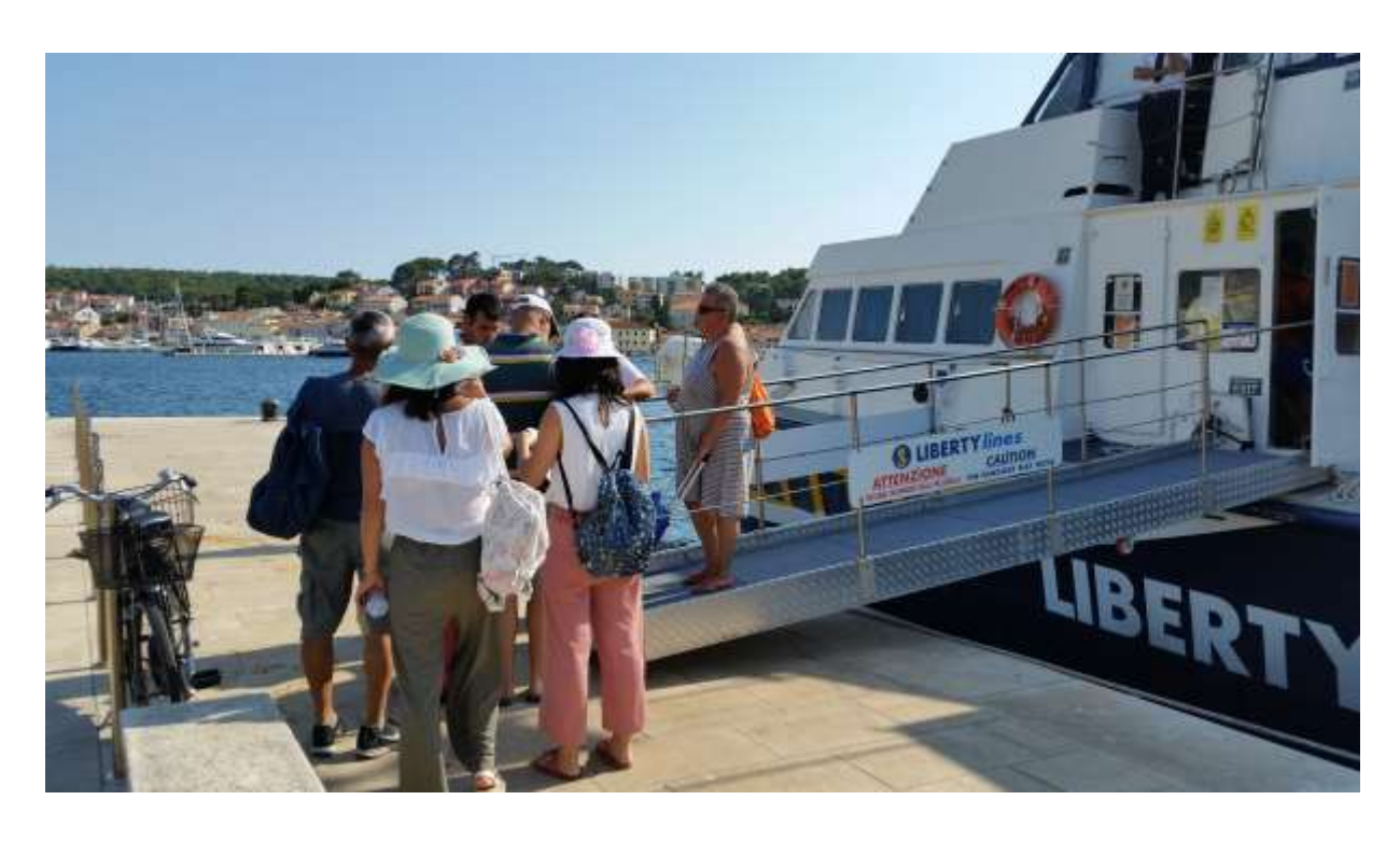
Figure 2: Passengers waiting to be embarked in the Port of Mali Lošinj

The Friuli-Venezia-Giulia pilot action developed in the MOSES project is the new maritime connection represented by the hydrofoil maritime passenger line between Trieste, Istria and Primorsko - Goranska County. This service was available from July 1<sup>st</sup> 2018 to September 7<sup>th</sup> 2018, with two connections per week (on Fridays and on Mondays), for a total number of 18 round trips, of which 9 along the axis Trieste – Pula - Mali Lošinj and 9 along the axis Trieste – Rovinj - Mali Lošinj. These services transported a total number of 2.381 passengers. The sailing schedule of both connections made possible to the passengers to extend their trips to Susak, using the existing lines of Jadrolinija company from and to Mali Lošinj.