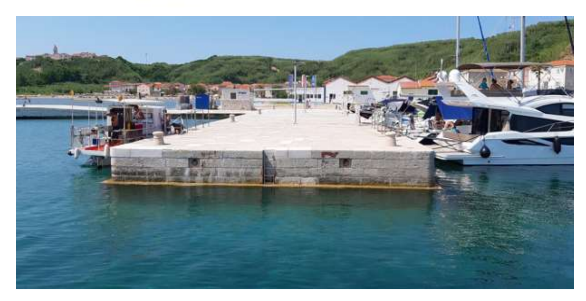
Figure 4: Reconstructed quay in the Port of Susak

Elaborated technical documentation for the reconstruction of the coastal wall enabled the Mali Lošinj Port Authority to plan the future investment in the Port of Susak.