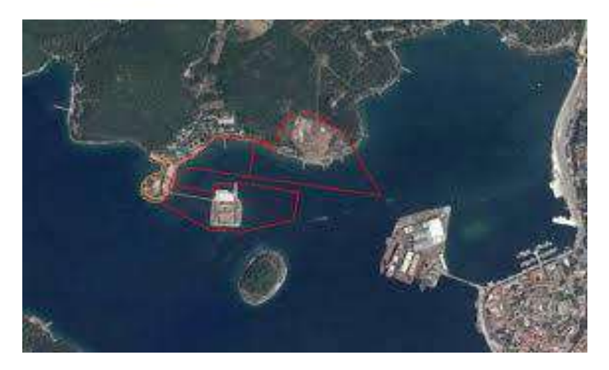
Figure 5: Location of the pilot activity in the Port of Pula

Main objectives of the pilot activity tend to contribute to the quality improvement of passenger services in the Programme area by taking effective measures at the port terminals, as well as to create necessary preconditions for the construction of the new passenger terminal in the Port of Pula and further sustainable development of cross - border maritime passenger transport.