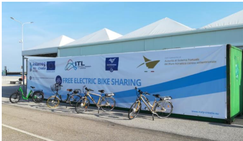
Figure 2. Mobile depot for e-bikes at Ravenna port.