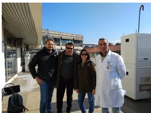
ISAC-CNR at Rijeka for the measurement for high-temporal measurement of particles

Within ECOMOBILITY the impact of ship traffic is being deeply investigated