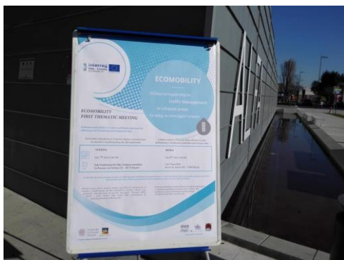
7th February 2019, Alfa Building, Scientific Campus of Ca' Foscari University of Venice