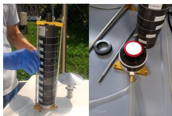
Sampling of particulate matter in various sizes