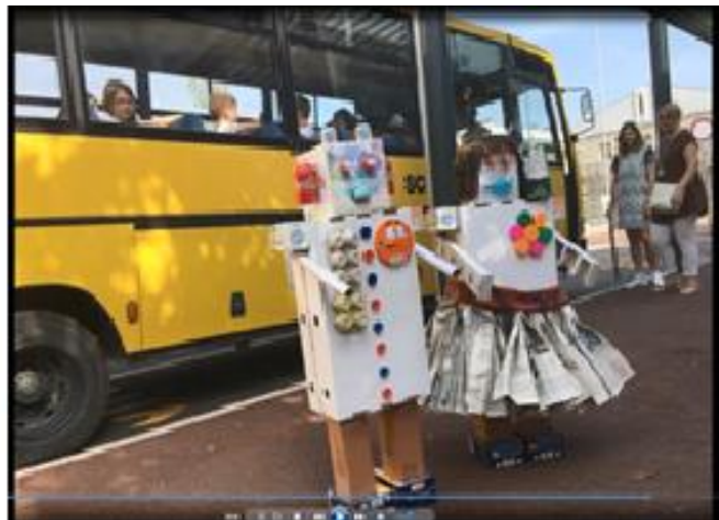
Figure 10 - Exhibition elaborate of primary school Fontaniva (PP1)