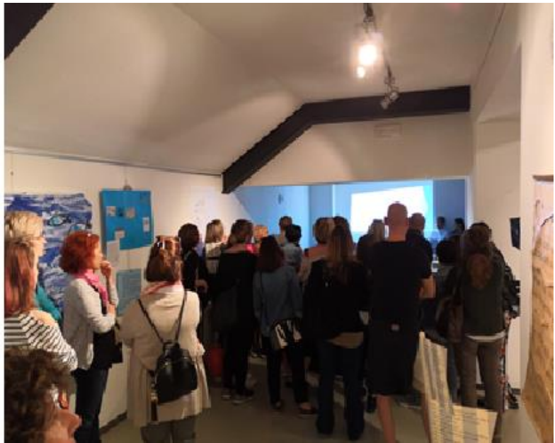
Figure 12 - Exhibition elaborate of primary school in Cattolica (PP2)