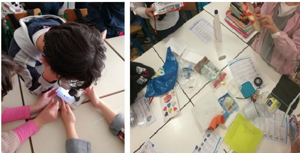
Figure 6 - Activities in Cattolica with children by PP2 (M.A.R.E.)