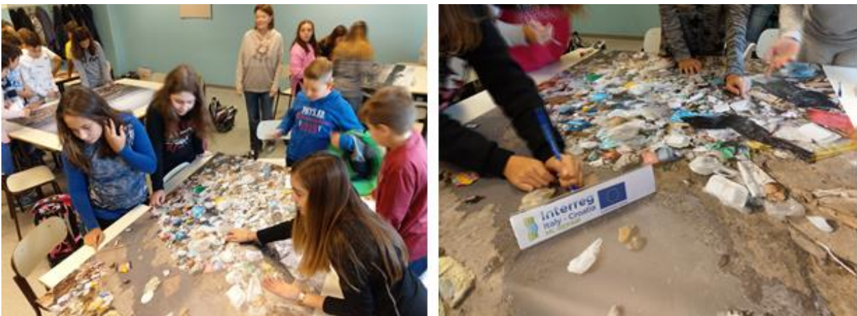
Figure 4 - First laboratory work for secondary school by PP3