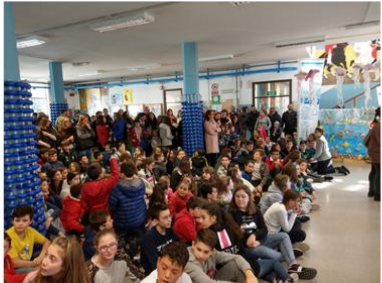
Figure 11 - Exhibition elaborate of primary school in Chioggia (PP3)