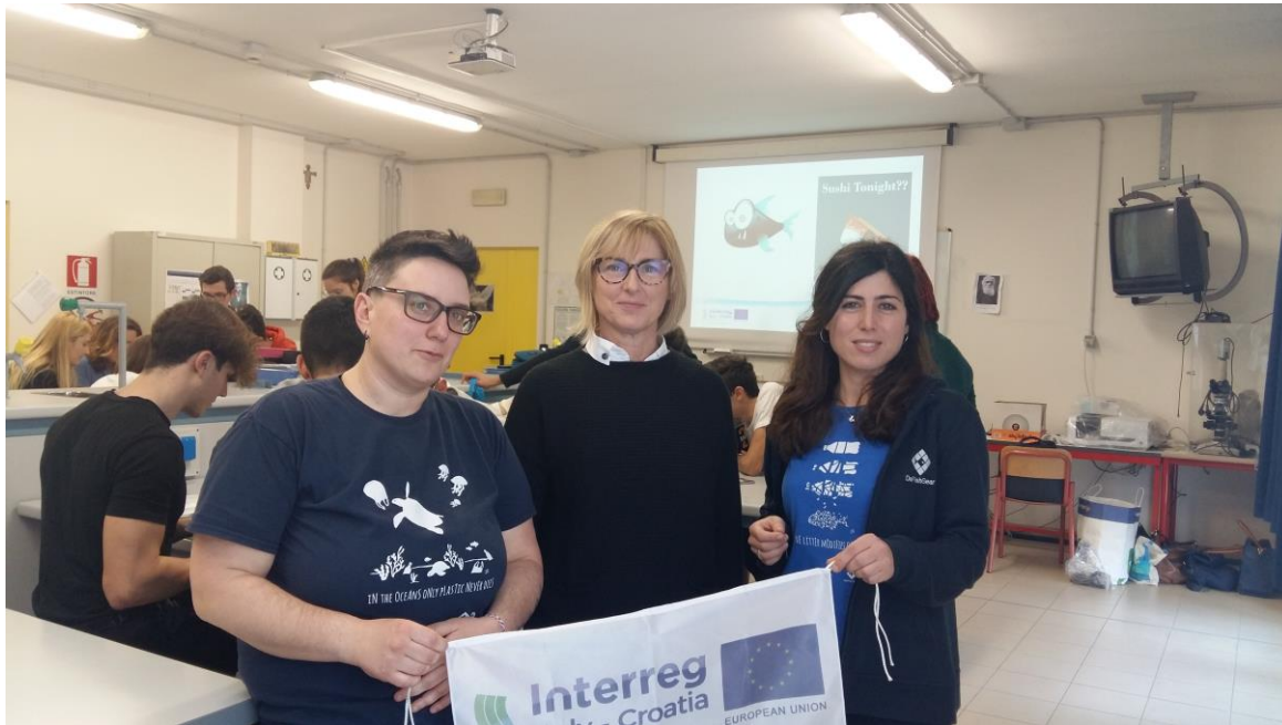
Figure 1 - Laboratory work in high school in Chioggia by PP1