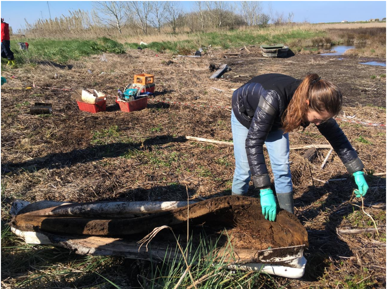
Figure 3 - Beach monitoring in Italy (PP1)