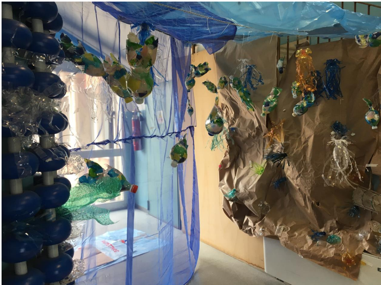
Figure 8 - Exhibition elaborate in secondary school Chioggia (PP1)