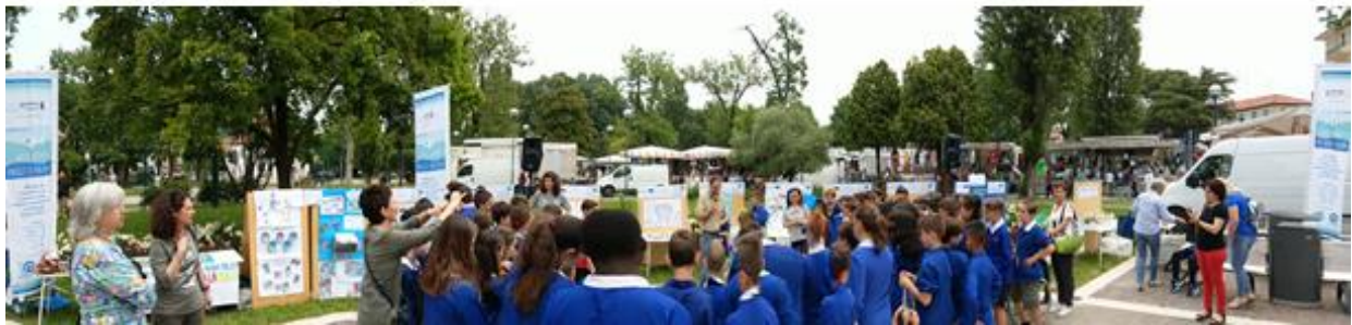
Figure 9 - Exhibition elaborate of primary school in Marghera (with Plastica(mente) and "Fish market litter exhibition") (PP3)