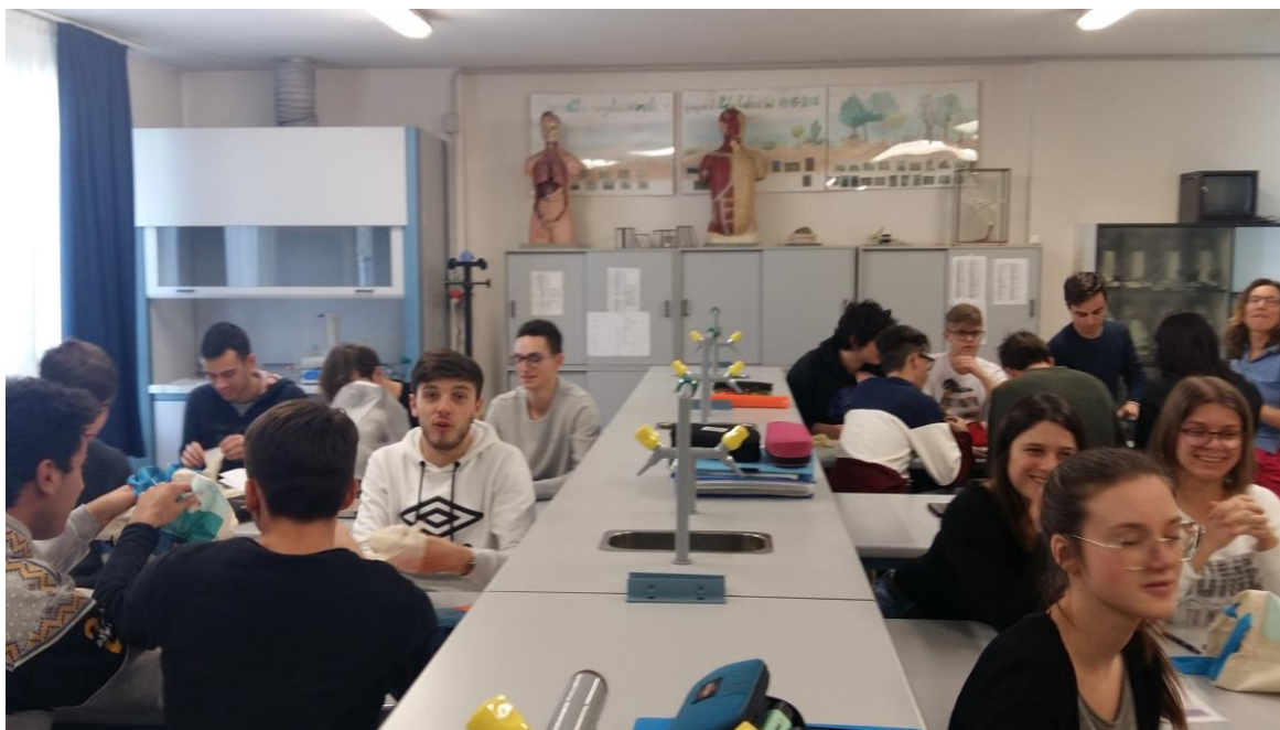
Figure 2 - high school children during laboratory work in Chioggia