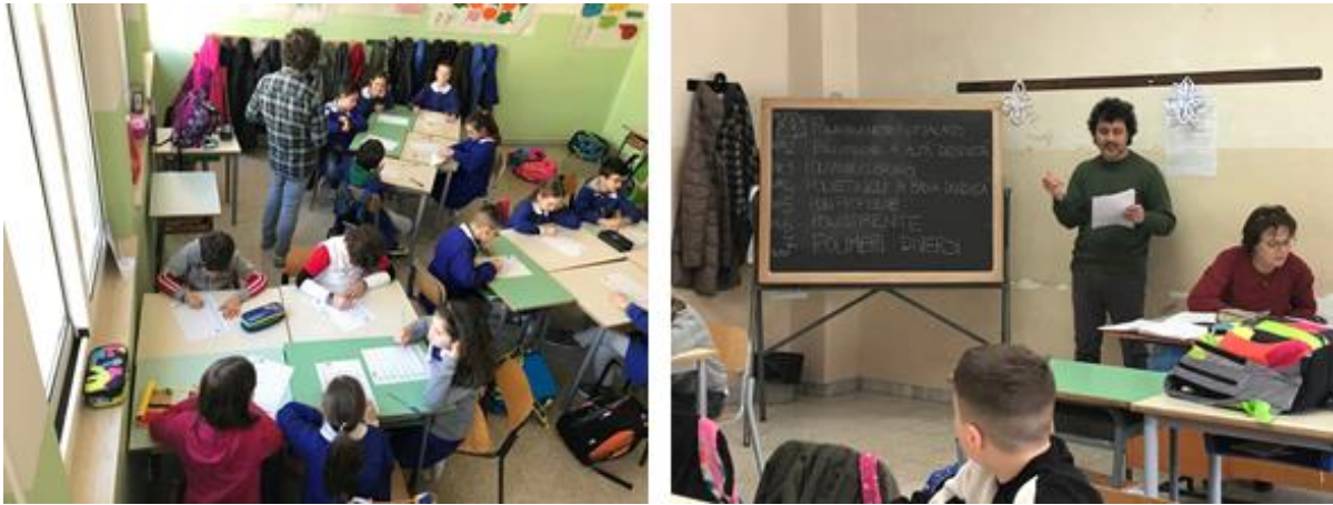
Figure 7 - Activities in Molfetta with children by PP2 (M.A.R.E.)