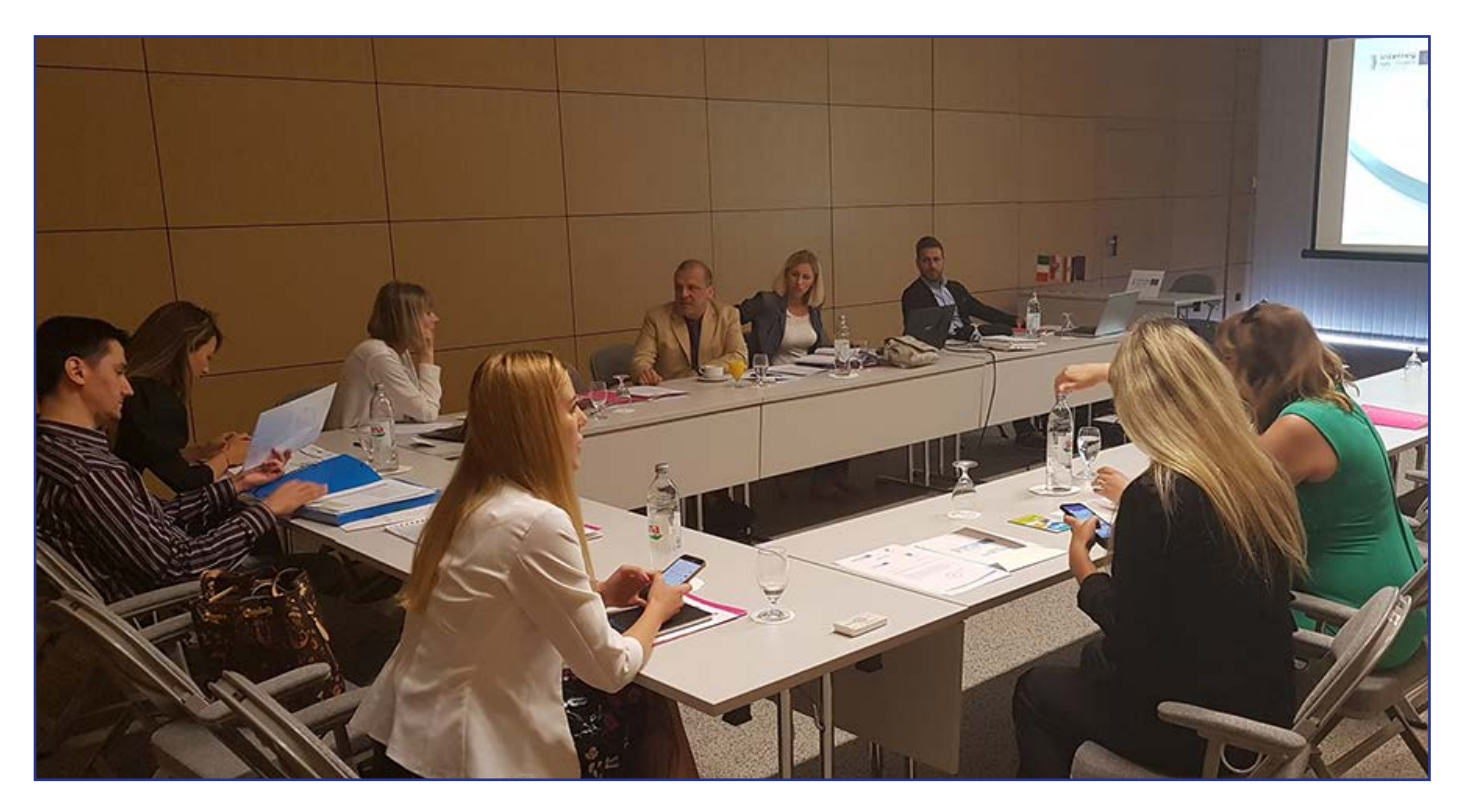
Dubrovnik Neretva County, has organised on the 29th-30th of May the 2nd partnership meeting and press conference of HERCULTOUR.

During the two days of the meeting, the italian and croatian partners analysed and discussed the state of implementation of the proposed activities for each single work package, specifically focusing the attention on all aspects of the guidelines, documents and good practises that have been (and will be) capitalised in the following months, plus assessing future steps of activities on the basis of the mutual iterregional cooperation.